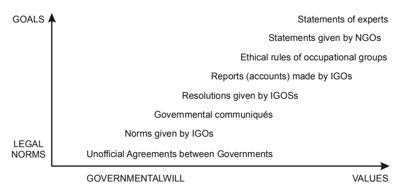
Fig. 2. International soft law documents (some examples)

Langet et al. (2006, p. 276) have pointed out that 'there exists a lack of clarity in the international system as to which type of rules should govern particular situations and conflicts'. For example, it is possible to use either formal rules (here 'hard law') or informal rules (here 'soft law'), but neither of these types of rules (formal/informal) should be preferred to the other, because both are subject to dispute and can lead to abuse (Lang et al. , 2006). Therefore both are needed!