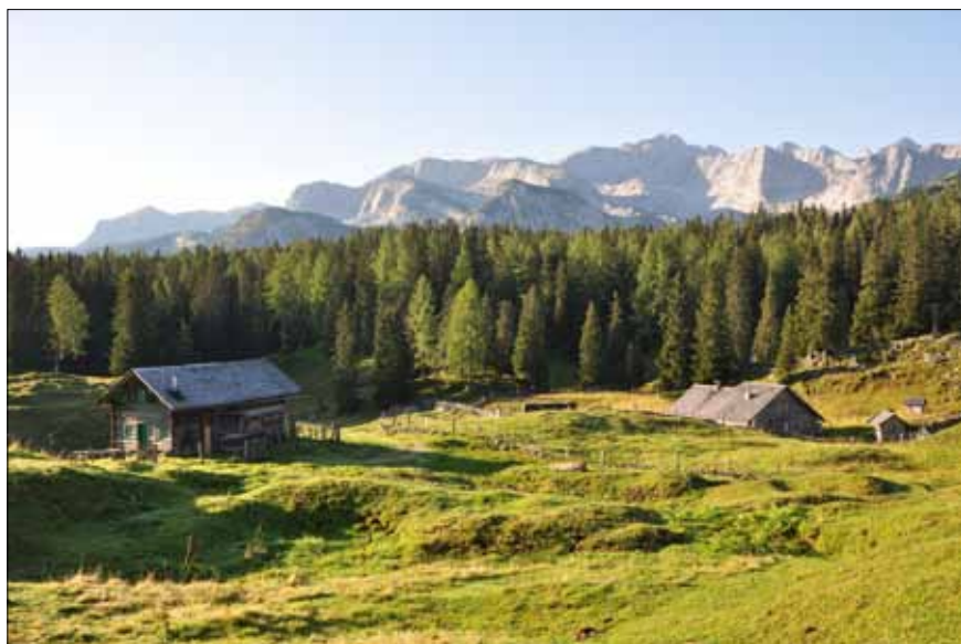
Fig. 3–5. Impressions from the UNESCO World Heritage Cultural Landscape Hallstatt-Dachstein / Salzkammergut