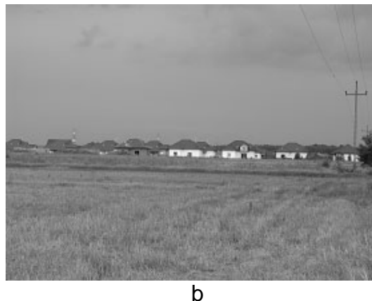
Fig. 1. Open space with a line of forest on the horizon (a); residential development interfering with open areas (b)