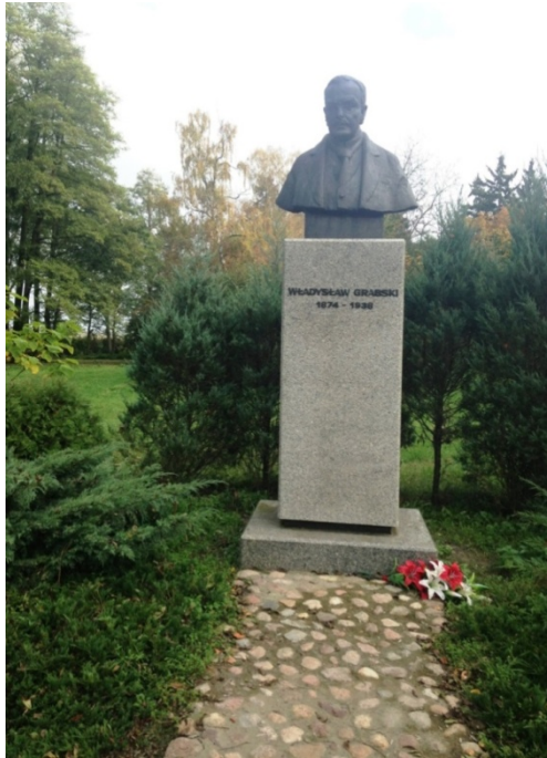
The monument of Władysław Grabski in Borów

He became engaged in the Central Agriculture Society, whose committee member he was since 1907. In the years 1913–14 he was the vice – chairman of the Society and the head of the office. W. Grabski founded the Bureau for Social Work and became its director in 1913. The Bureau’s activities were aimed at providing public education and erecting school buildings. At that time he also worked on publishing the Statistical Yearbooks of the Congress Kingdom of Poland.