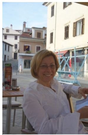
Slovenia 2010