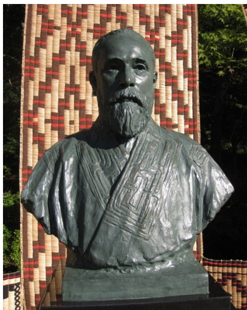
Fig. 2. The monument of Bronisław Piłsudski in Shiraoui

As a result of the long-term efforts of Japanese circles, Polish diplomatic services and the Department of Culture and National Heritage, a monument to Bronisław Piłsudski was erected. It was unveiled in Shiraoui, on the site of the Ainu Museum, and an international conference devoted to Bronisław Piłsudski was held at the University of Sapporo. This project was co-funded with the support of the Department of Cultural Heritage. In the unveiling ceremony, among others Minister Bogdan Zdrojewski took part.