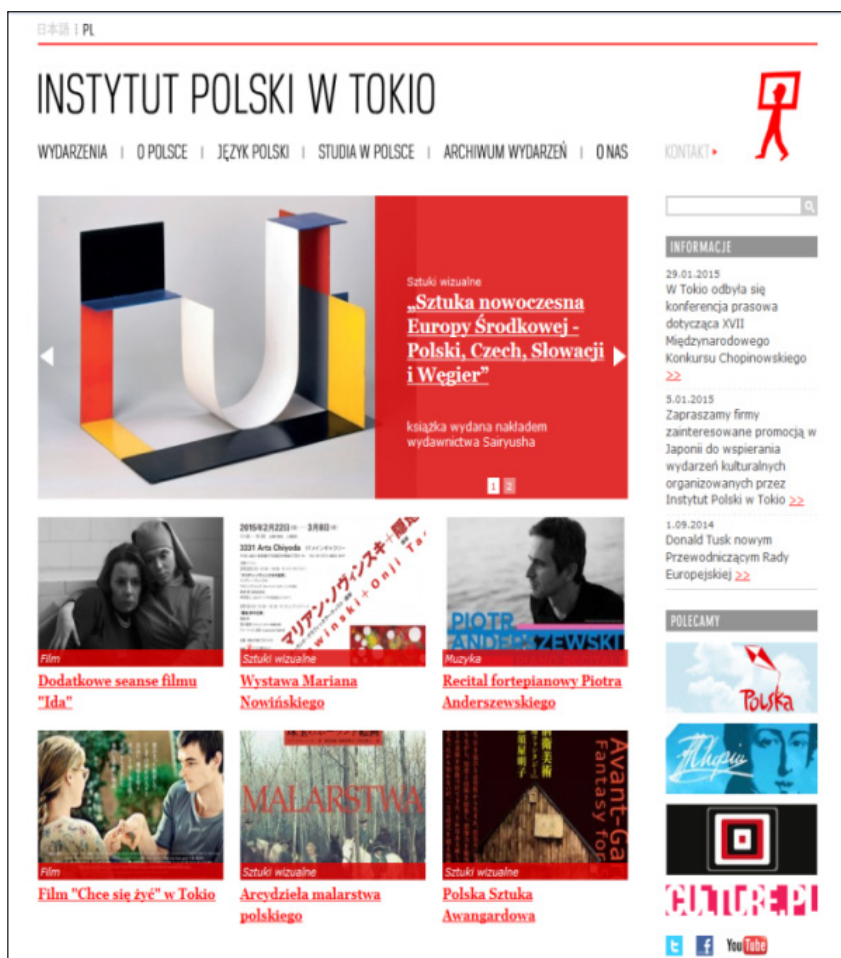
Fig. 3. The website of Polish Institute in Tokyo

Through the activity of 23 Polish Institutes in the world, as well as cultural sections of Polish Embassies, the Ministry of Foreign Affairs helps create the image of present-day Poland, including its culture, social and intellectual achievements of Poles, and contributes to the widespread popularization of the achievements of the Polish nation in the world. As already mentioned, in 2011 the first Polish Institute in Asia was established in Tokyo, largely thanks to the efforts of the then-Ambassador of Poland, the function of which was performed by the author of these words.