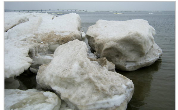
Photo 6. Fragments of a grease ice ridge (Międzyzdroje, 18 th February 2012)