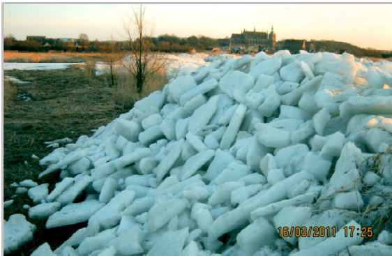
Photo 11. The leeward side of a hummock on the south-eastern bank of Vistula Lagoon (Frombork, 16 th March 2011)