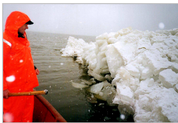
Photo 18. A weathered hummock in the south-eastern part of Gardno Lake (Gardna Mała, 18 th March 2005)