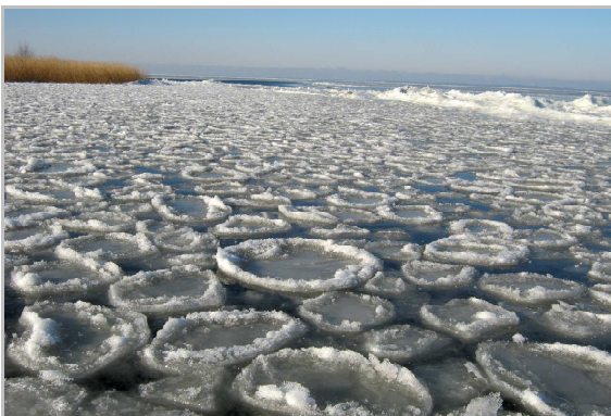
Photo 13. Pancake ice in the southern part of Szczecin Lagoon (Podgradzie, 1 st February 2012)