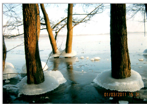
Photo 20. Ice rings around tree trunks in the northern part of Miedwie Lake (Morzyczyn, 1 st March 2011)