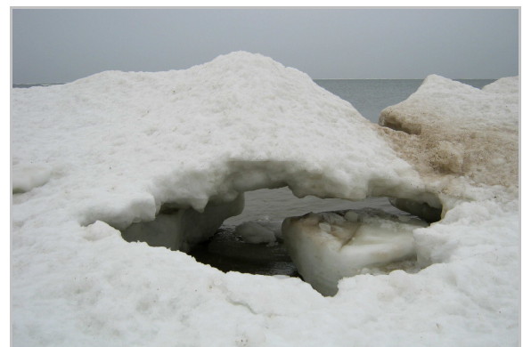
Photo 7. An opening in a grease ice ridge viewed from the leeward side (Międzyzdroje, 18 th February 2012)