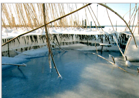
Photo 19. Three layers of ice rind in the north-eastern part of Dąbie Lake (Lubczyna, 25 th January 2014)