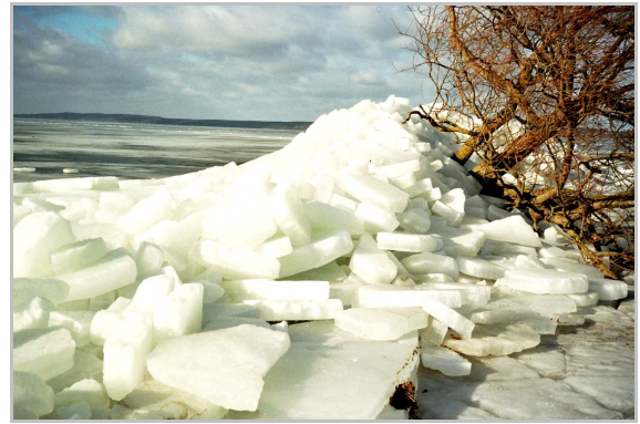
Photo 10. A hummock in the eastern part of Szczecin Lagoon (Rów Peninsula, 8 th February 2011)