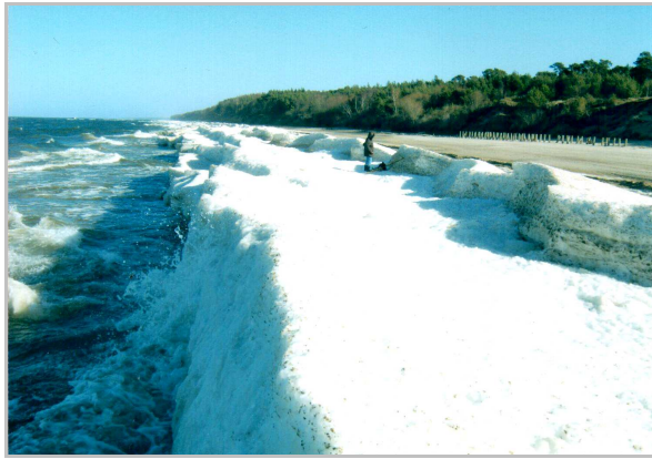
Photo 1. A grease ice ridge on the south coast of the Baltic Sea (Dziwnówek, 23 rd February 2012)