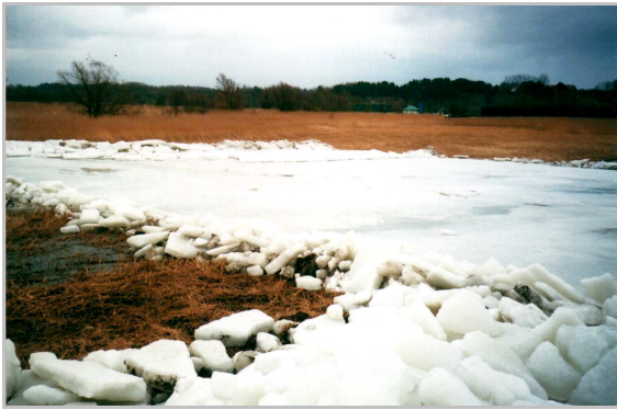
Photo 9. A thrust ice sheet on the south-eastern bank of Vistula Lagoon (Frombork, 11 th February 2011)