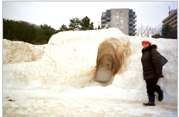
Photo 4. The windward side of a grease ice ridge with a niche (Międzyzdroje, 15 th January 2011)