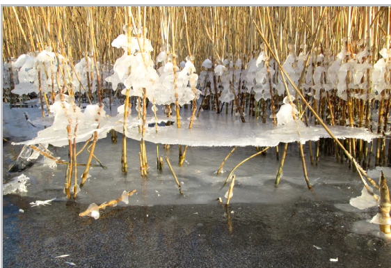
Photo 15. Iced reed in the eastern part of Szczecin Lagoon (Czarnocin, 25 th January 2014)