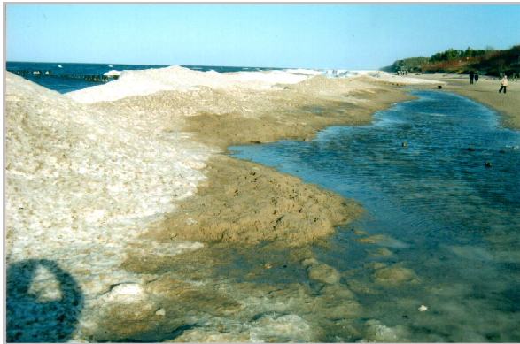
Photo 3. The leeward side of a grease ice ridge (Dziwnówek, 23 rd February 2012)