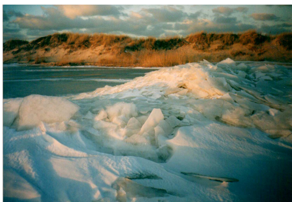
Photo 17. Ice rind piling in the northern part of Łebsko Lake (Madwiny, 19 th December 2002)