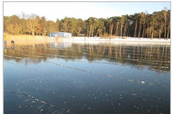
Photo 14. Smooth, transparent ice in the eastern part of Szczecin Lagoon (Czarnocin, 25 th January 2014)