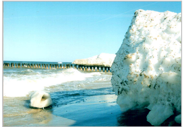
Photo 2. Vertical wall of a grease ice ridge on the windward side (Dziwnówek, 23 rd February 2012)