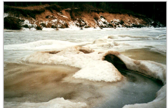
Photo 12. Grease ice canals, tunnels and cones in the southern part of Szczecin Lagoon (Miroszewo, 13 th December 2010)