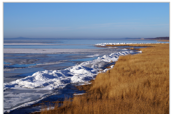
Photo 16. Hummocks in the north-eastern part of Łebsko Lake (Rąbka, 3 rd March 2013)