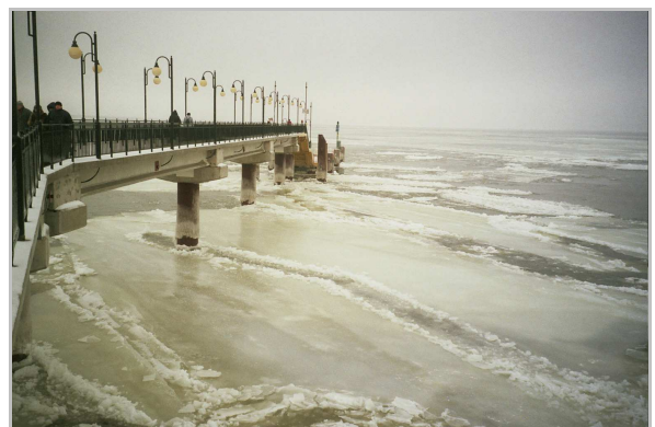
Photo 8. Floe cut by the pier pillars (Międzyzdroje, 30 th December 2010)