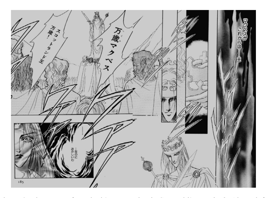
Figure 2. The scene of Macbeth's coronation in Sanazaki's Macbeth . Above left, the lords are celebrating the new king's coronation on the Stone of Scone, saying "Hail, Macbeth, King of Scotland!" Bottom left, Grouch, Lady Macbeth, says "This is not what I wanted." © Sanazaki Harumo