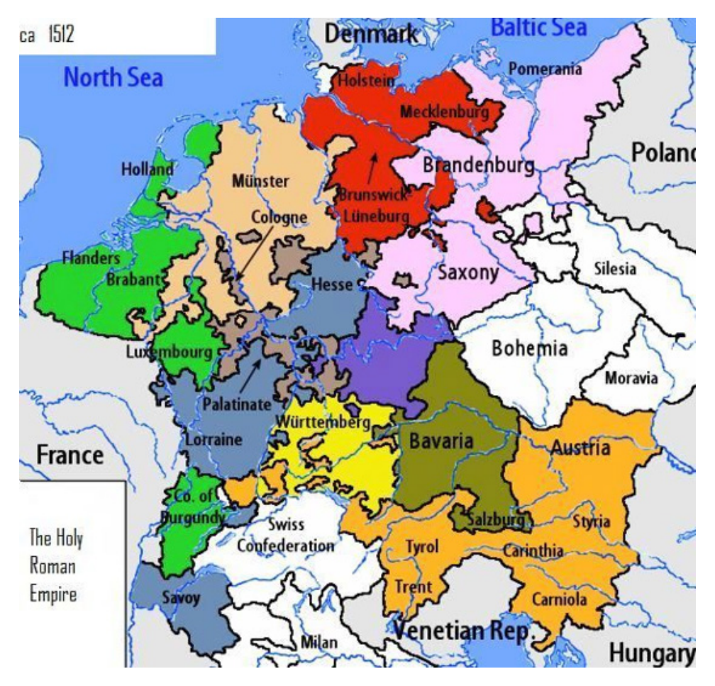
Fig. 2. The Holy Roman Empire (c. 1512)

there are enemies and disorder. Enemies have to be thought and disorder needs to be dealt not through contractual relations but by means of power: by Machtpolitik . Since the late eighteenth century Europe has also been national to an increasing extent. It has come to be defined by nation-state. This process culminated in the post-WWII bipolar system that subsumed all political syntheses. Bipolarity brought about the maximum level of politicization through hierarchization. Indeed, the tensions between the two superpowers kept the community of states in line and well ordered. There was no other choice. All controversies were regulated through this kind of opposition.