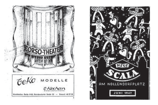
Figs. 5–6. Covers of Corso theatre programs, 4–10 June 1948 (left), and Neue Scala theatre, June 1947 (right)

Such materials have existed since the early days of cinema, yet the tradition of printed programs for theatrical or operatic performances dates back even further. Today, cinema programs have largely been replaced by digital media. However, printed programs are still in use, especially in small cinemas offering less popular films. In contrast to other types of film promotion, which distributors are often fully in charge of,<sup>3</sup> materials produced by cinemas are especially interesting in the field of audience research since they are addressed to local cinemagoers. Obviously, cinema programs do not only supply information as such – they are also one of the "routine procedures for creating consumer identification of [...] theatres to attend".<sup>4</sup> Thus, they contain additional elements such as information on the location of the film theatre, its logo or sometimes even a picture of the place. For example, the cover of the Corso theatre program (fig. 5) depicts its façade (in a later version it displays a rather symbolic version of it – see fig. 1.), the cover of the Neue Scala program (fig. 6) depicts its silhouette with the characteristic two towers at Nollendorfplatz in Berlin.