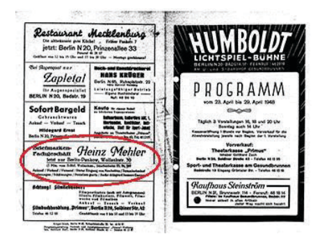
Fig. 22. A Humboldt Lichtspiel-Bühne program, 23–29 April 1948. The cinema was located in the French occupied zone, even though it contained an ad for a shop for stamp collectors in Pankow, a district in East Berlin

By the end of 1949, the Rheinschloß-Lichtspiele theatre in Berlin-Friedenau (American sector) started to print an ad for moving services, saying the company would move customers' goods to the West. Since the cinema was not close to the Soviet sector and thus probably not frequented by East Berliners, this ad addressed West Berliners who wanted to move to West Germany. Yet it also makes us think of mobility within Berlin and especially among cinemagoers. Until the Berlin Wall was built, people could move more or less freely between the sectors,<sup>31</sup> even during the blockade of 1948/1949 although they were not allowed to transport any goods.<sup>32</sup>