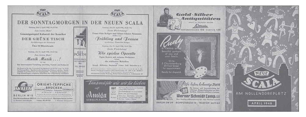
Fig. 19. The program of the Neue Scala theatre from April 1947, inside (left) and cover (right)

This stratification is reflected in the programs, of both luxury cinemas (e.g. Neue Scala or Film Bühne-Wien) and modest district theatres (e.g. Kammerspiele Britz or Palladium). The differences resulted not only from the cinema's location or size but also from their repertoire as luxury theatres were allowed to screen premieres. This was not only a matter of prestige but also of quality; the longer a copy of a film was screened in other cinemas the worse the quality of this copy became. Unfortunately, we can hardly confirm the differences between the theatres by comparing ticket prices since they were neither printed in the programs nor on the tickets themselves. Speaking of which, some tickets also displayed ads on the reverse side, as can be seen on an example from the Film-Bühne-Wien theatre.