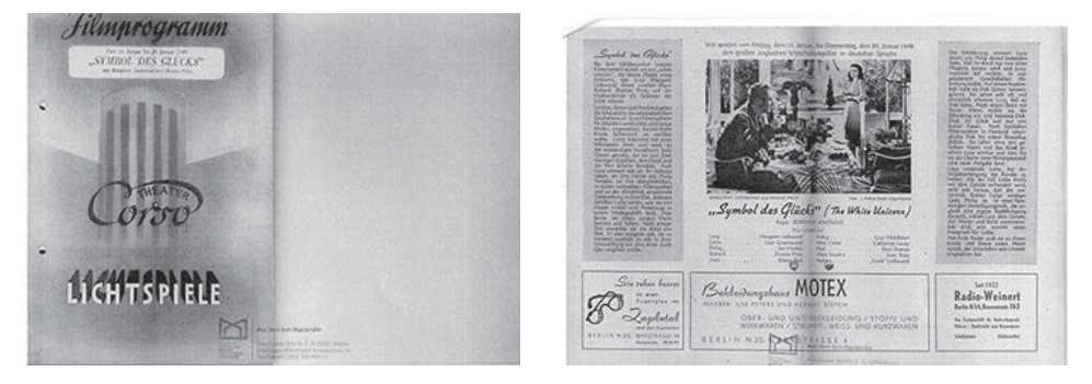
Figs. 1-2. Cinema program from Corso film theatre, 14-20 January 1949, cover and inside

The term "cinema programs" has two meanings. On the one hand, it refers to combining different films into one screening or the repertoire of a film theatre, which has become a significant field of research in recent years.<sup>2</sup> On the other hand, it denotes printed information about the program of a particular cinema, i.e. flyers or booklets containing a list of titles screened over a certain period of time; usually a week or month, as well as short descriptions of the films. In this paper, I focus on the latter understanding of cinema programs (the German equivalent being: Kinoprogramme , sometimes Filmprogramme or Hausprogramme ). Figures 1–4 show two typical examples of cinema programs in Berlin during the late 1940s.