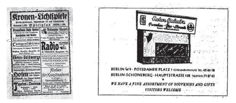
Fig. 15 (left). Kronen-Lichtspiele program, ca. 1925. There are ads for a shop selling stockings, jackets and baby-products (upper-left hand corner), floor care products (upper-right hand corner), a watchmaker and a jeweler (left side in the middle) or a gallery and portrait painter (bot-tom-right hand corner)

programs from the American and British sectors were printed in English, they must have also been addressed to foreigners, most notably allied soldiers (fig. 16). Speaking of which, some programs contained ads for language courses and translation services especially for English, French and Russian. Since these ads were written in German, they addressed a German audience who needed or wanted to communicate with foreign soldiers ["Kronen", April 1947; "Palladium", September 1947].