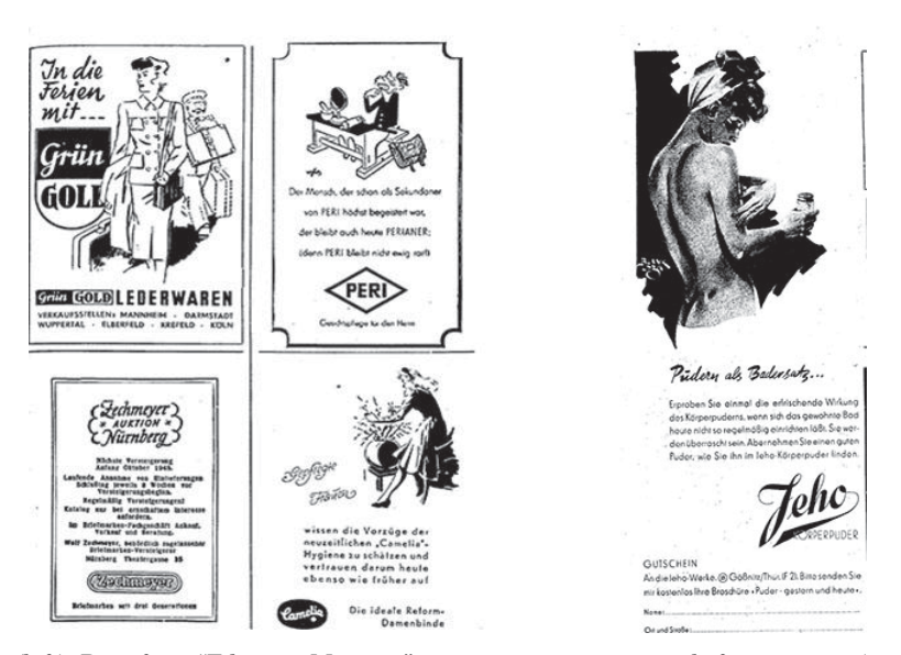
Fig. 13 (left). Page from "Filmpost-Magazin" 1948, no. 6, containing ads for suitcases (upper lefthand corner), cosmetics for men (upper-right hand corner), an auction house (bottom left hand corner) and sanitary towels (bottom-right hand corner)

Fig. 14 (right). Ad for body powder from "Filmpost-Magazin" 1947, no. 5. Caption: "Powder as a bathing substitute. Try out the refreshing effect of body powder, if you cannot have a normal bath..."