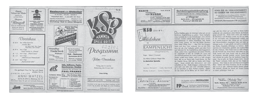
Figs. 3–4. Cinema program from KSB (= Kammerspiele Britz) film theatre, 13–19 June 1947, front and reverse side

Such materials have existed since the early days of cinema, yet the tradition of printed programs for theatrical or operatic performances dates back even further. Today, cinema programs have largely been replaced by digital media. However, printed programs are still in use, especially in small cinemas offering less popular films. In contrast to other types of film promotion, which distributors are often fully in charge of,<sup>3</sup> materials produced by cinemas are especially interesting in the field of audience research since they are addressed to local cinemagoers. Obviously, cinema programs do not only supply information as such – they are also one of the "routine procedures for creating consumer identification of [...] theatres to attend".<sup>4</sup> Thus, they contain additional elements such as information on the location of the film theatre, its logo or sometimes even a picture of the place. For example, the cover of the Corso theatre program (fig. 5) depicts its façade (in a later version it displays a rather symbolic version of it – see fig. 1.), the cover of the Neue Scala program (fig. 6) depicts its silhouette with the characteristic two towers at Nollendorfplatz in Berlin.