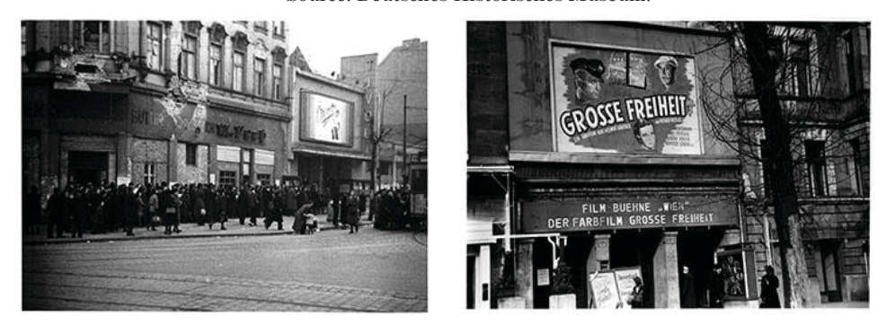
Figs. 23–24. Left 1947, right 1945 (the premiere of Gro\beta e Freiheit Nr 7 took place on 6 September 1945)

Film-Bühne-Wien theatre (right) saying that tickets for Große Freiheit Nr 7 (G: 1944, dir. Helmut Käutner, starring Hans Albers) were sold out.<sup>37</sup> Source: Deutsches Historisches Museum.