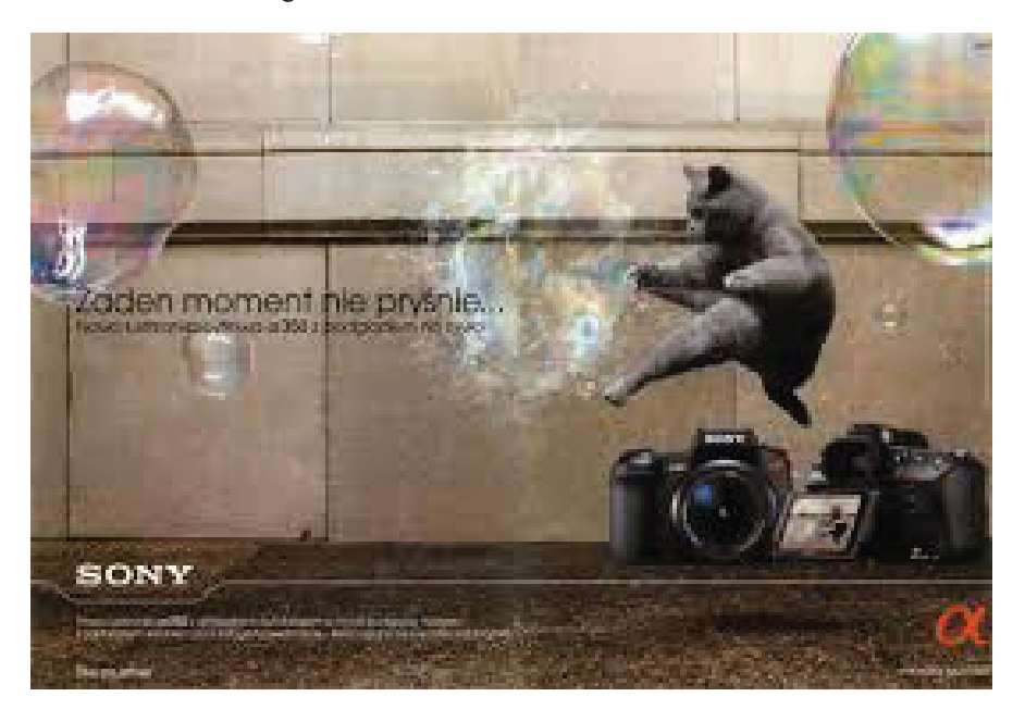
Figure 1. Advertisement of SONY cameras

A metaphorical reference to two imagination-based layers in advertising may be included in just the slogan, in the slogan and the image, or potentially in just the image. I discuss all those types of metaphor usage in advertising in the article entitled Metafora w reklamie , which in in press. Here, I shall discuss the mechanism for analysing and interpreting a selected advertisement for SONY cameras. Its metaphor is clear only as a result of the parallel reception of the slogan and the image. Without the image the slogan would be unintelligible. The advertisement's structure is complex; one must undertake a considerable mental effort to understand and interpret it.