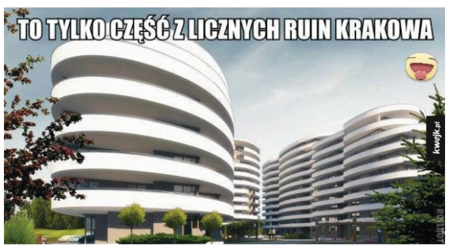
MINISTER ZOROWIA OSTRZEGA PRZED KWEIK.DI