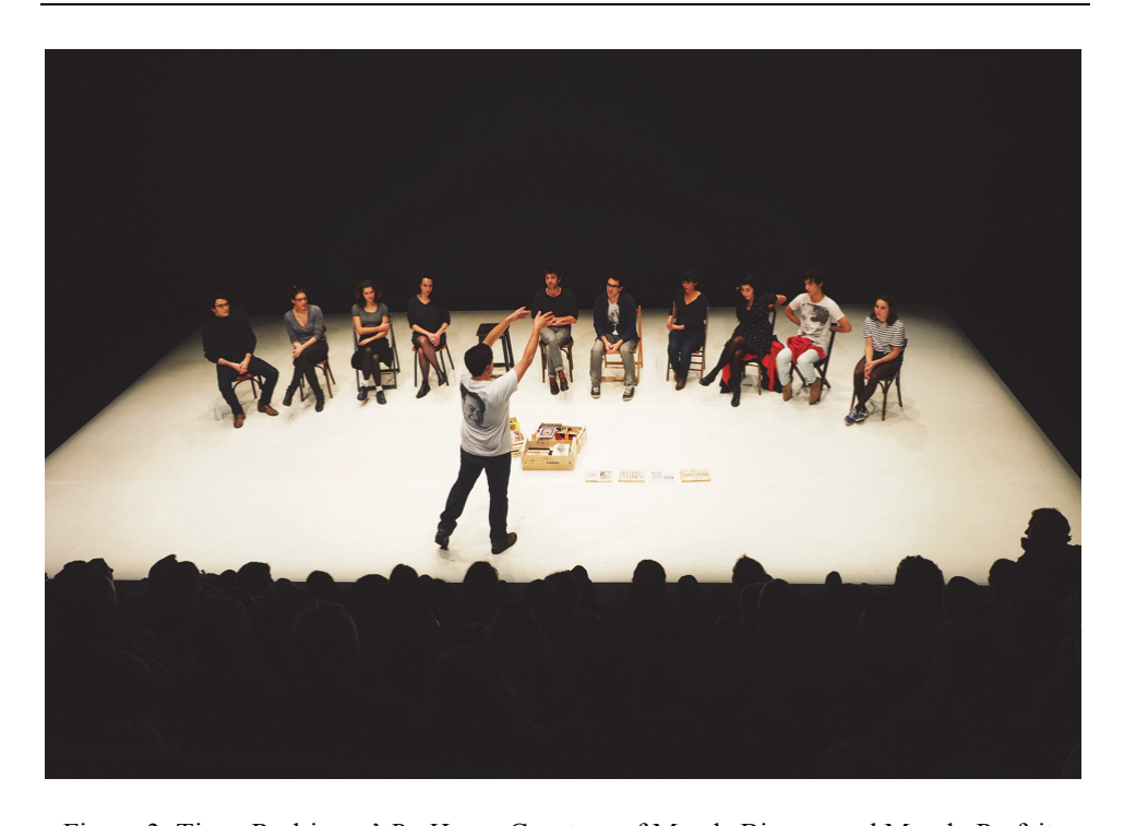
Figure 3: Tiago Rodrigues' By Heart.

to learn the Sonnet to end granted them the role of co-creators of a section of the performance along with Rodrigues, a more substantial role than that envisaged for the audience that participated in the Lear discussed earlier.