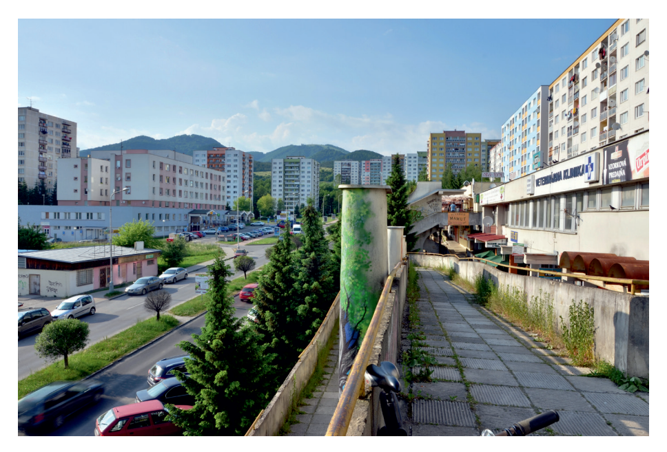
Fig. 1. The central axis of housing estate Rudlová-Sásová II includes many of the key amenities

The highest percentage of overall coverage by key amenities was recorded in housing estates Sásová II (59.9%) and Rudlová II (58.8%) (Fig. 1). Housing estates Fončorda Mládežnícka (45.8%) and Fončorda Tulská (45.3%) have approached the 50%. The lowest percentage of 0% of overall coverage by key amenities was recorded in the housing estates Bakossova, Uhlisko, Trieda Hradca Králové, Kráľová, Mateja Bela (Fig. 2), Rudlová-Sásová I and Severná. Fig. 3 shows the overall coverage by key amenities within the city of Banská Bystrica.