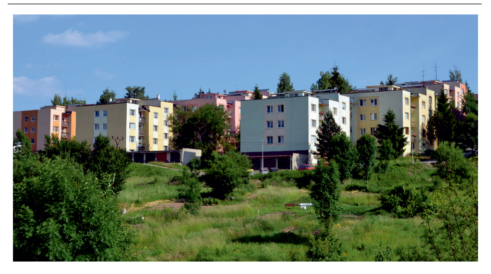
Fig. 2. Housing estate Mateja Bela located eccentrically to urban development axes is one of the housing estates with the worst accessibility of the key amenities