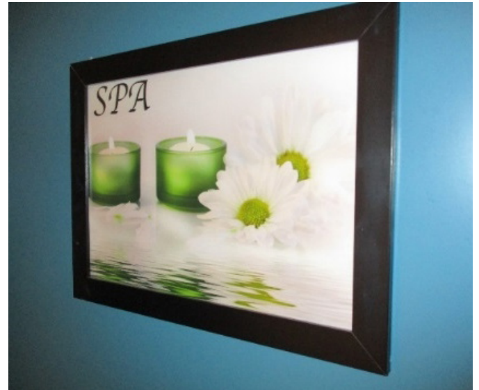
Figure 3. Fieldwork photo of the sign on the inside of the spa bathroom door that informs anyone using the room that it is a spa.

Tea lights and candles were commonly used as an indexical expression in Seaview Lodge, as the spa door sign showed. There were small battery-operated tea lights and wax candles in the dining rooms. Candles also featured on various signs, such as the spa bathroom sign and the staff toilet sign. Indeed, the staff toilet sign pictured not only a candle but also a white rolled-up towel, aromatherapy bottles, a white flower, and a text announcing it to be a “Toilet and Mini Spa.” Inside were a toilet, a washbasin, and a small shelf with cleaning products, toilet paper, and a bowl with potpourri. These indexical expressions were clearly not for residents, but an example of how staff accomplished the spa theme in areas only they accessed.