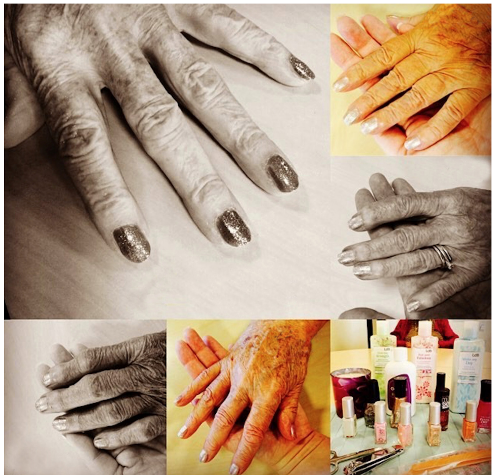
Figure 5. Seaview Lodge Instagram post announcing “Beautiful nails à la glitter and glamour at Seaview Lodge.” The photo on the bottom right shows the manicure products and candle.

Whereas the use of the staff “mini spa” was reserved exclusively for staff and visitors, manicures were limited to residents only. For reasons of hygiene, staff were prohibited from wearing nail varnish, but it was common for residents to paint their nails, and some of the women had extravagantly decorated nails with glitter or rhinestones glued on. This too was sometimes part of the excessive indexical expressions, as shown by an Instagram post that announced: “Beautiful nails à la glitter and glamour at Seaview Lodge.” The photo shows the hands of five residents together with a photo of a variety of colored nail polishes, nail clippers, nail files, and a candle in a pink candle holder.