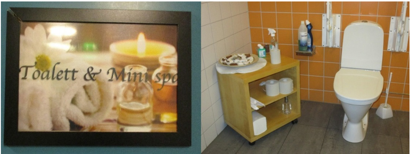
Figure 4. Fieldwork photos of the sign on the staff “Toilet and Mini Spa” and the layout of the room in question.

Whereas the use of the staff “mini spa” was reserved exclusively for staff and visitors, manicures were limited to residents only. For reasons of hygiene, staff were prohibited from wearing nail varnish, but it was common for residents to paint their nails, and some of the women had extravagantly decorated nails with glitter or rhinestones glued on. This too was sometimes part of the excessive indexical expressions, as shown by an Instagram post that announced: “Beautiful nails à la glitter and glamour at Seaview Lodge.” The photo shows the hands of five residents together with a photo of a variety of colored nail polishes, nail clippers, nail files, and a candle in a pink candle holder.