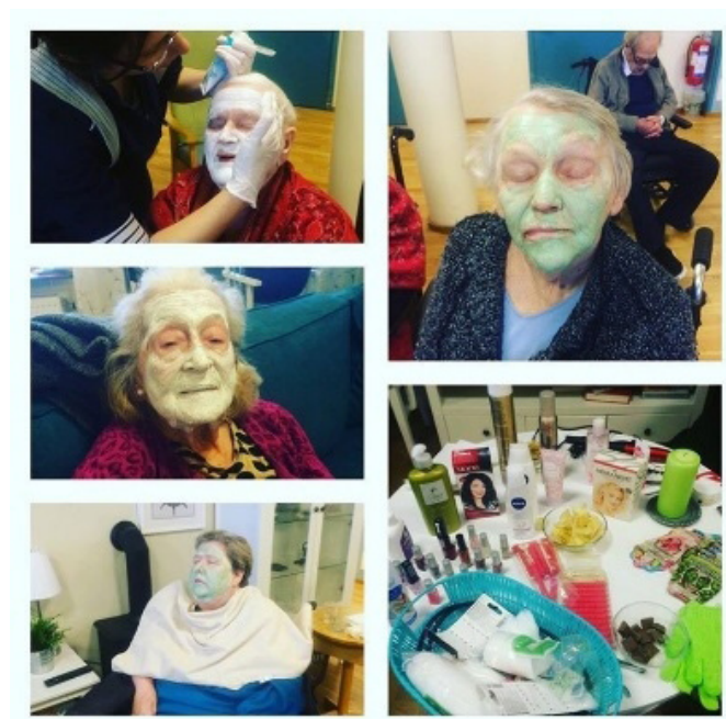
Figure 1. A Seaview Lodge Instagram post announcing “Today we celebrate our women on International Women’s Day by giving them some spa treatments!”

Four of the photos show women with face packs, the fifth a table with a candle, peeling gloves, hair curlers, a curling iron, bowls of crisps and chocolates, nail polish, cotton-wool pads, hair dye, and body lotion. To index spa solely with some hair spray or a bowl of crisps would be fragile in the extreme, but by putting a large number of objects together a more solid spa-ness is created. The excessive indexical expressions, in combination with an Instagram text that explicitly described them as spa treatments, spelt out what kind of situation was in mind.