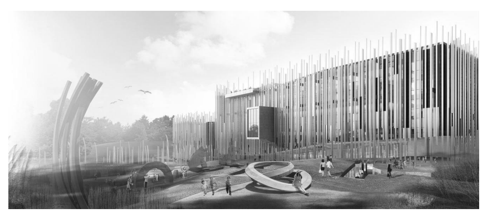
Fig. 1. Kris Yao, Design of New Taipei City Museum of Art, 2015. Source: Kris Yao.

museum building is largely embedded into urban planning strategies and city development, the analysis monitors the complete design process from the city government's urban and institutional planning strategies over architectural design to the museum's mission statement. The investigation is concerned with museum design concepts (the software), but not with the construction of the museum (the hardware). It expresses particular interest in the concatenation of museum curating and city curating. For this reason, it will focus on the "idea" competition for the New Taipei City Museum of Art that was conducted in 2011, and not cover the professional competition whose final award winning design of Kris Yao, a Taiwanese architect, was announced in 2015 (see fig. 1).