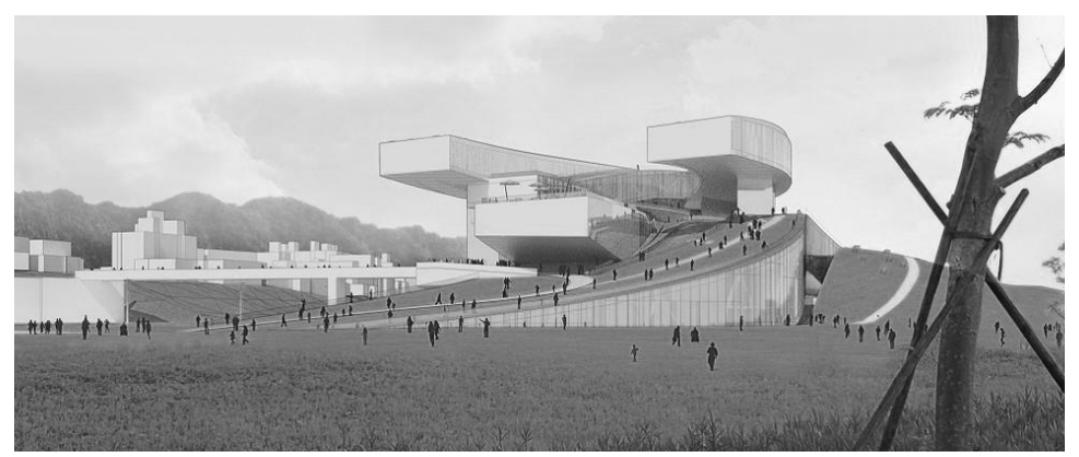
Fig. 3. Museum Design of Atelier Boronski & Jean-Loup Baldacci for New Taipei City Museum of Art, International Design Competition 2011.

extraterrestrial space dimensions.<sup>11</sup> While visualizing and modeling high-flying museum dreams, some architects have blanked out the local reality and culture. The design by the London-based architecture practice "meterbuilt," for instance, was disqualified by the Taiwanese blogger community for a major linguistic faux-pas, as it showed a Chinese writing on the museum's entry side in simplified Chinese instead of traditional Mandarin characters which are used in Taiwan.