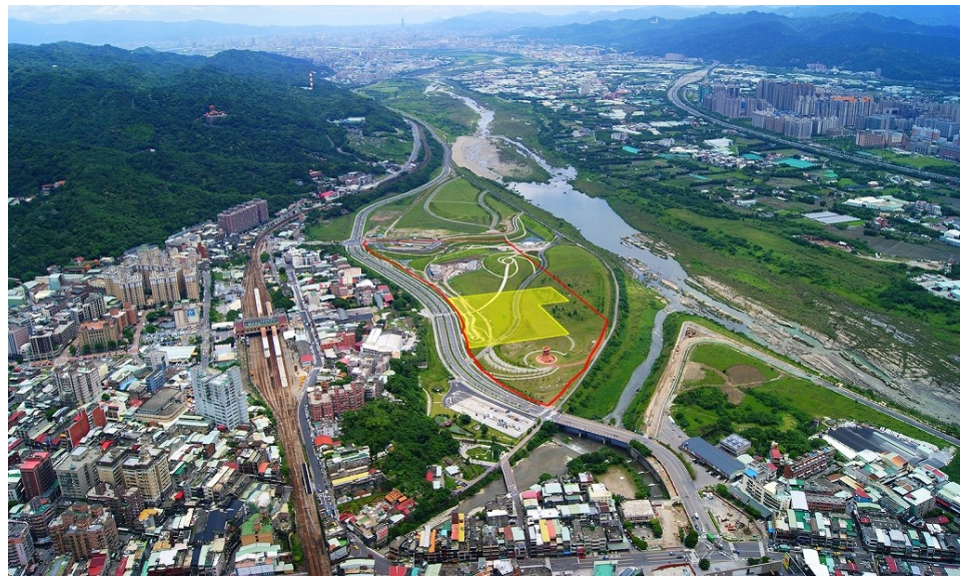
Fig. 2. Site for the construction of the New Taipei City Museum of Art.

cultural and historical significance of this heritage and formed a Treasure Group, magically called "The Seven Beautiful Families," under the responsibility of the Bureau of Cultural Affairs in order to "welcome a new museum era" that will transform New Taipei City into a fascinating museum (city). Flagship projects of the emerging museumscape are the New Taipei City Ceramics Museum in Yingge, the Lei Meishu Museum (a memorial gallery commemorating the merits of the artist and architect Lei Meishu), and the New Taipei City Hakka Museum, opened with the aim to conserve and research the Hakka culture and promote the cultural integration of different ethnic groups, including the indigenous people of Taiwan. Within this cluster of museums, one important museum type was a missing link: a museum of contemporary art by which the newness of New Taipei City, its aspiration to become the new regional capital of Taiwan and a top-city tourist destination on the cultural world map, could be adequately represented.