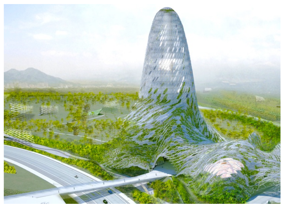
Fig. 5. Museum Design of the Practice Kengo Kuma & Associates for the New Taipei City Museum of Art, International Design Competition 2011. Source: Kengo Kuma & Associates.

the main hall of the museum, purposed to serve as a communication hub where workshops and gatherings take place and public and private life merge, connects with the nearby Yingge train station, a cable car and the riverbank trail. The mixed-used conception of the museum as a cultural, commercial and leisure hub finds its expression in the incorporation of retail facilities, park pavilions, and a flexible event program. The singular, monolithic institution of the contemporary art museum melts into a museum city park built on self-sustainability. Based on the principle of the green cell, the New Taipei City Museum of Art is transformed into an eco museum. The steel mesh which shapes the organic structure of the museum is capped with a mix of different cells, a combination of ETFE<sup>18</sup> cushions, solar cells, ventilation louvers and green roof cells with LED screens. Equipped with this cellular form of highly sophisticated bio-technology, the museum can easily switch between art museum and eco museum. The breathable double-skin enables to incorporate the surrounding energy and nature environment, and to exteriorize the inner life of the museum and the nature of art.