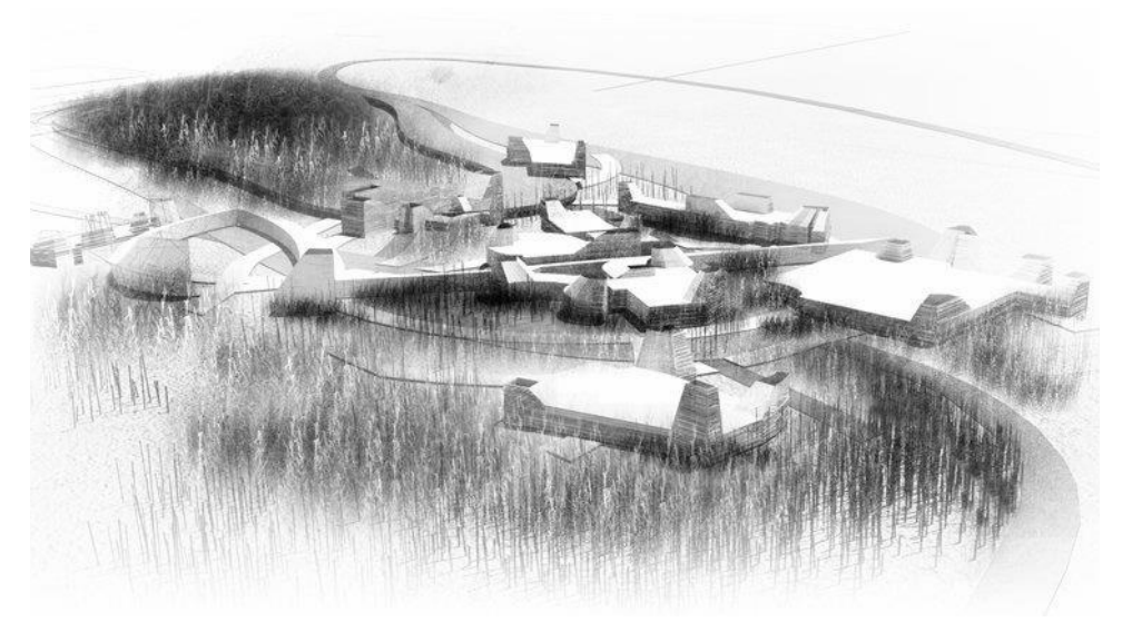
Fig. 6. Aerial View of the Museum Design of Federico Soriano Pelaez for the New Taipei City Museum of Art, International Design Competition 2011. Source: Estudio Federico Soriano Pelaez.

The microstructural element of the architectural design, the energy-saving and environmentally-friendly green cell is scaled up to a macrostructural urban cell – the green museum city. By the imprint of innovative eco architecture, the contemporary art museum is morphed into an urban Green Museum. The third winning proposal by the Spanish architect Federico Soriano Pelaez has taken a completely different approach (see fig. 6).