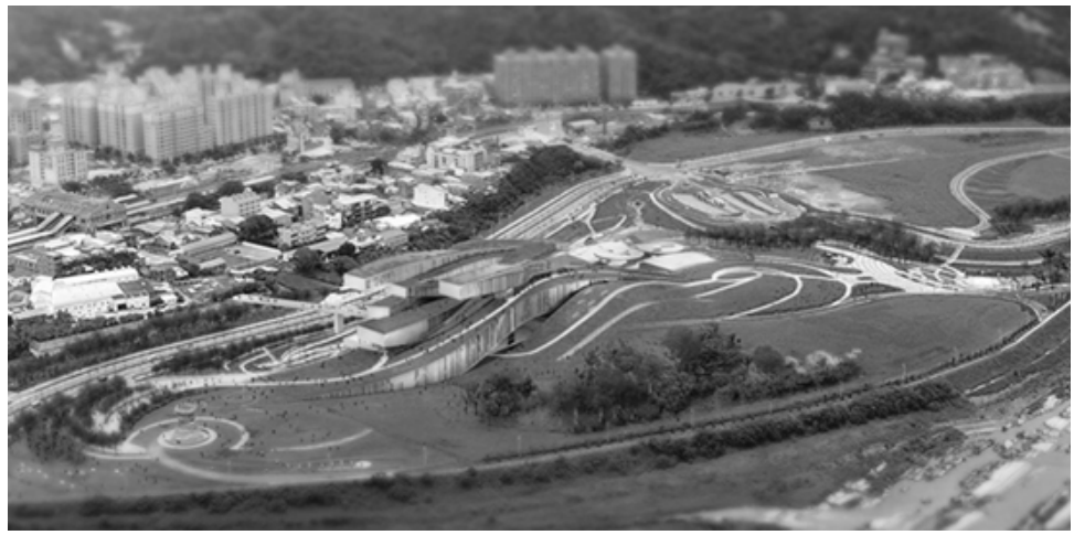
Fig. 4. Atelier Boronski & Jean-Loup Baldacci, Urbanscape View of the New Taipei City Museum of Art.

the sky."<sup>12</sup> This full embeddedness into the natural environment and infrastructural network of the city with its parklands and streets suggests a new notion of the museum as urban field (see fig. 4). Besides being designed as the new landmark of New Taipei City in the literal sense of "marking the land" on the site of undeveloped nature area, the museum is featured as a landscape, thus turning city architecture into iconic geo-topography.