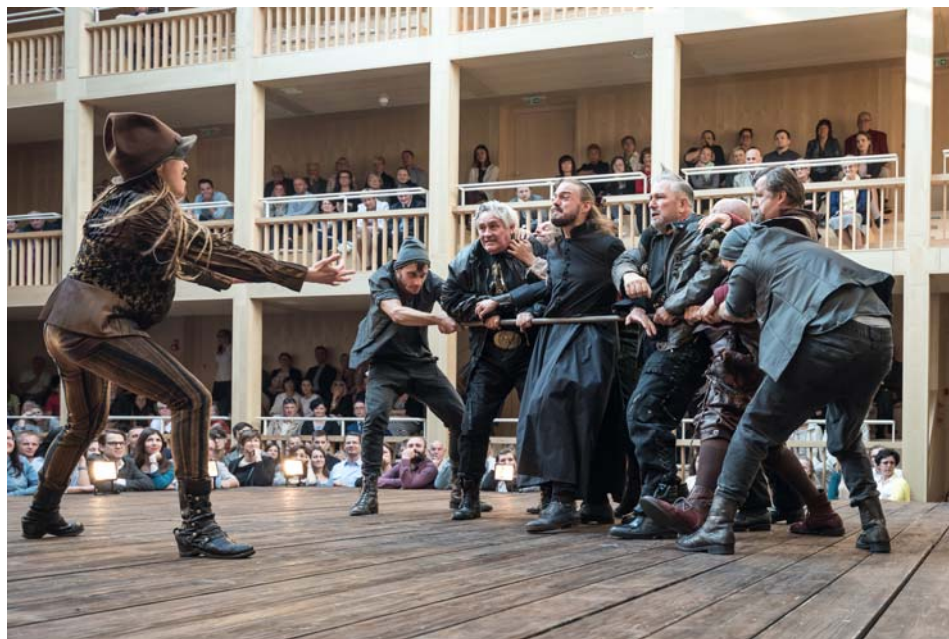
Fig. 1.

The audience was able to admire these beautiful costumes up close largely thanks to the new stage layout. For the first time since the theatre's opening we were able to witness the malleability and full potential of its movable stage. Abandoning the classical setup for the thrust stage of Shakespeare's times was the key to the production's overall look and tone as well as its acting style and stage movement. Not only did the standing audience have access to the stage from three sides, allowing them an unprecedented proximity to the actors from multiple perspectives, but also they had the chance to literally mingle with them as the performers often joined "the groundlings", addressed them directly, threw items of clothing at them, or simply asked for a light. Such lively interaction together with the actors' unhindered movement, which often extended from the acting area into the auditorium, were the main driving force behind the show and defined it throughout by the performers' vitality, rule-breaking and anarchic spirit.