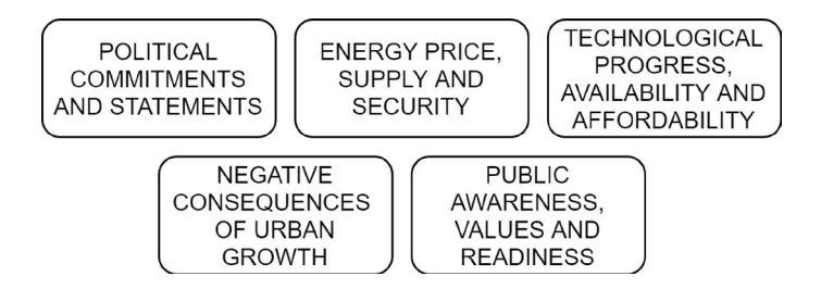
Fig. 1. Factors supporting emissions reduction in public transportation

With the growth of urban population and the increase in rates of urbanisation, the adoption of sustainable mobility has become central to the processes of urban planning (Montero, 2017). Sustainable urban transportation systems will play an increasingly critical role in driving responsible climate action and reducing global emissions (C40 Group, 2017). Nowadays urban transportation is responsible for a quarter of the total CO_2 emissions from transportation in the EU (EC, 2011). It is possible to state that the political target to reduce this share correlates with the shift of public opinion towards the values of sustainable development. Under the influence of such factors as the negative consequences of motorisation, the situation at the energy markets (especially in Central and Eastern Europe), technological progress, and availability of cheaper and greener transportation modes (i.e., electric vehicles), the transformation of public transit is already happening across the region (Fig. 1).