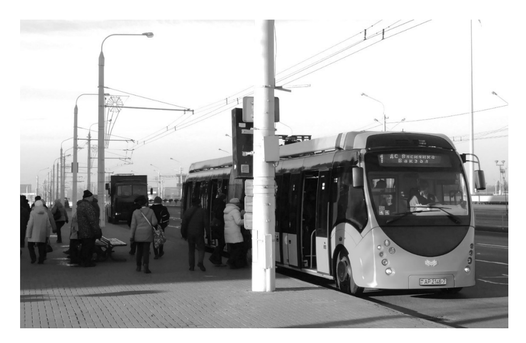
Fig. 4. Electric bus "E433 Vitovt MAX Electro" in Minsk, Belarus

environmental reasons. In 2018, after the deployment of electric buses on route No. 1 instead of existing diesel buses, the network had grown to 29 km, and it connects the geographical, economic, and transportation city centre (main bus and railway terminals) with residential areas and sports infrastructure facilities (Minsk-Arena on route 1).