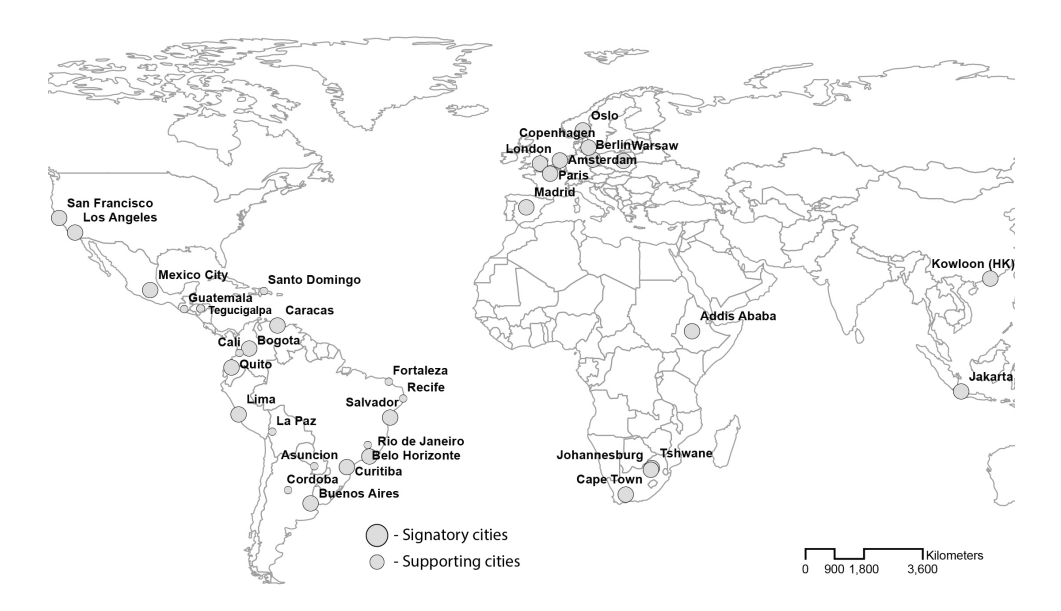
Fig. 2. C40 Climate Leadership Group cities, supporting "Clean Bus Declaration of Intent", 2017

commitment to efforts. Its goal is to improve air quality by introducing low and zero emission vehicles in urban bus fleets. A geographical analysis of the spatial distribution of the signatory cities shows the leading role of Europe in promoting practices and measures to reduce the negative impact of urban transportation. 31% of C40 "Clean Bus Declaration of Intent" signatory cities are located there (Fig. 2).