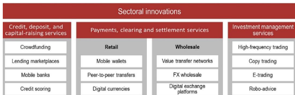
Figure 2. Sectoral innovation in finance provided by fintech

Fintech companies and banks offer the range of similar services and products, but in fintech „differently from banks, the information they use is based on big data not on long term relationships; access to services is only decentralized through internet platforms; risk and maturity transformation is not carried out; lenders and borrowers or investors and investment opportunities are matched directly” (Navaretti et al., 2018: 10). Financial start-ups create innovative products within areas that are traditionally occupied by financial intermediaries. In the graphics below (Figure 2) types of innovations introduced by fintech are presented.