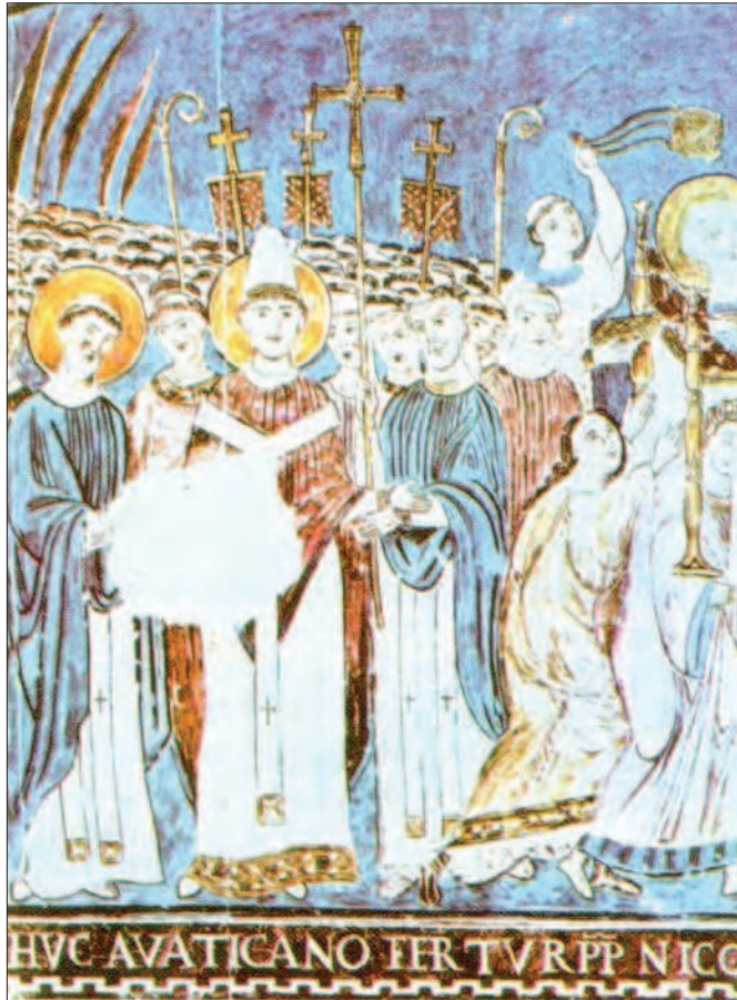
Translation of relics of St. Clement, part of the 11 th -century fresco from the Basilica of San Clemente, Rome

only had not immediately shined as a saint, but after his death, at the end of 885, the new Pope, Stephen V, accused him of inconsistency of faith, violation of oaths and tolerance to prejudice, and forbade the Slavic language liturgy under threat of excommunication. About 40 years later, Pope John X instructed the bishop of Split, Dalmatia, not to succumb to the doctrines of Methodius which were not found in the books by the holy fathers, and forbade the appointment of Slavic priests. In 1061, Pope Alexander II confirmed the edicts of the Church Council of Split in 1059/1060 in which Methodius, who had already been called heretic, was mentioned as the inventor of the Slavic letters and founder of a false teaching against the dogmas of the Roman Catholic Church.