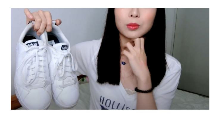
Figure 3. A Chinese tourist holds up a pair of Adidas sneakers to show it to her online audiences

tion, these tourist resellers turn their journey to the US into a win-win situation for their customers in China and themselves.