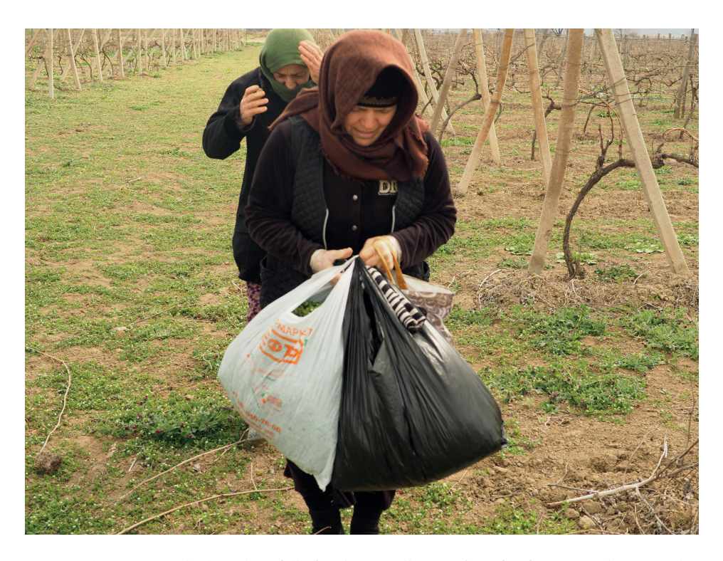
Fig. 2. The women with plastic bags full of mokrica (Stellaria media ), after foraging in the vineyard. Lowland Daghestan. Author: Iwona Kaliszewska, 2019.

When all the plastic bags brought to the site were almost full, the women decided that we should finish collecting (Fig. 2) and we went back to the village.