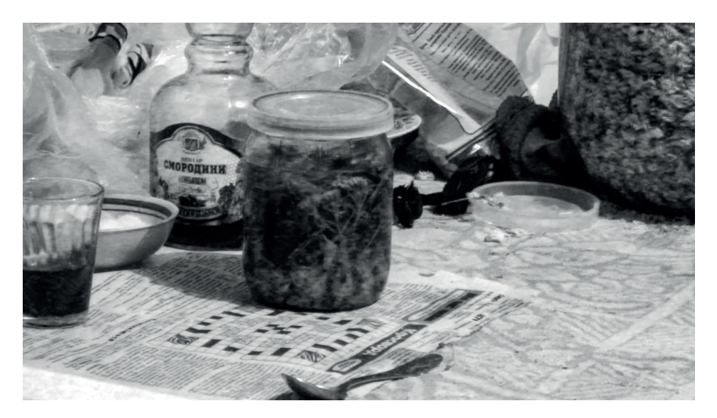
Fig. 1. The process of akacia ( Robinia pseudoacacia ) tea preparation. Podilia, Ukraine. Author: Jacek Wajszczak, 2013

In the meantime, the water in the kettle was boiling. A handful of akacia and several inflorescences of derevij and zveraboj were taken out of plastic bags and put into a small (300 ml) jar (Fig. 1). Babka Stasia poured boiling water onto the herbs. She inhaled loudly and asked: "Can you feel the smell spreading in the kitchen? Each herb has its own scent. Akacia smells like summer, like June in the middle of winter." Smelling was very important to her. She encouraged us to smell all the herbs she showed us.