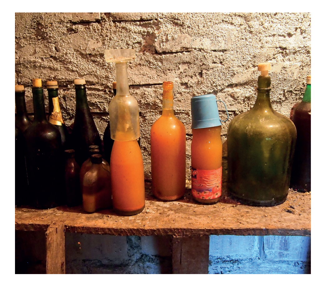
Fig. 3. Homemade wine from the fruit of pitanga (Eugenia uniflora) made by a descendant of German migrants in Misiones, Argentina. Author: Monika Kujawska 2014.

also the allelochemicals present in fruits, which makes their taste and smell so attractive to people, and that makes them safe too when consumed in moderation. Another reason for consuming these wild fruits were the positive memories triggered through their smell and taste. On occasions, study participants would compare pitanga, yva hai or guavira with fruits available in grocery shops, and would contrast the complex taste of the former with the blunt sweetness of fully domesticated market fruits. Myrtaceae fruits are consumed on the spot as raw snacks, a practice due both to the context of consumption and to the scent of the fruits which is lost after some time (volatile oils evaporate). Some descendants of European migrants prepare homemade wine from pitanga, cerella and yaboticaba (Fig. 3). This practice seem being influenced by the tradition of making preserves for wintertime and a wide expertise in homemade fermentation (Łuczaj 2010), brought from their countries of origin.