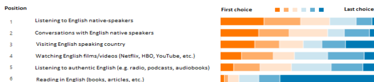
Figure 2: The effectiveness of pronunciation improving techniques outside English classes assessed by students.

The main aim of the third question in the questionnaire was to find out about students' preferences for the L2 pronunciation techniques that they use as self-development tools outside English classes. The results are presented in Figure 2 below.