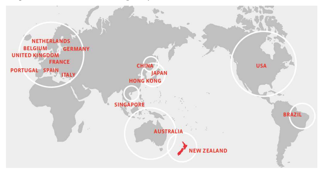
Graph 1. LOHAS markets identified globally