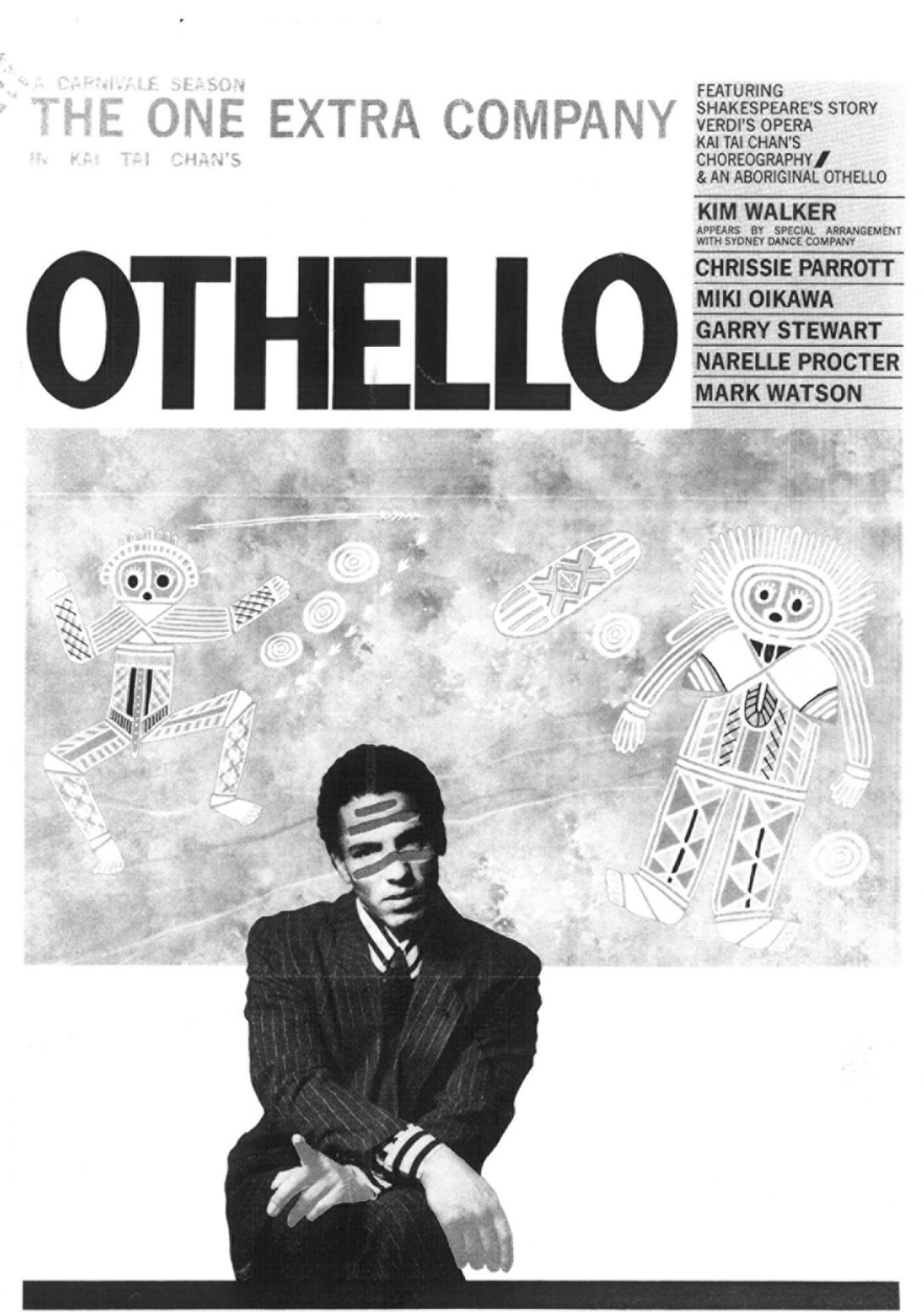
BELVOIR ST. THEATRE SEPT. 2 - 17 TUES — SUN. 699 3257