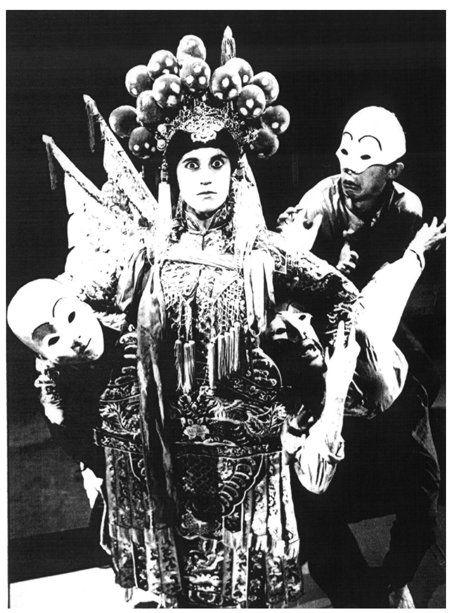
Figure 3: Warrior Woman Kate in Kai Tai Chan's The Shrew . One Extra Company, 1986.

surprisingly apt contexts: 19th-century China and present-day Australia. Cutting from one setting to the other, or even overlapping them, enables him to take an ironic viewpoint which heightens both the comedy and the underlying tragedy" (Percival The Times ). * The Shrew was important particularly for this marrying of