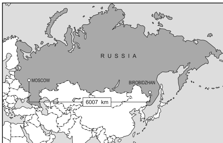
Fig. 1. Distance between Moscow and the JAR

anti-Semitism before and after World War II, destructions of libraries 4 , the fall of communism and Birobidzhan's continued, renewed existence and the revival of Jewish life in the post-Soviet JAR are not only a curious legacy of Soviet national policy, but after the break-up of the USSR and the religious worldwide rebirth, represent an interesting case-study in order to examine some geographic problems and interethnic relations.