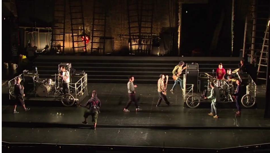
Beijing bands Suffocated and Miserable Faith in rehearsal in Edinburgh from 'Chinese Coriolanus at Edinburgh Festival' Vimeo posted by KT Wong Foundation. Available from http://vimeo.com/73625869 [accessed 17/03/2014] Moving image