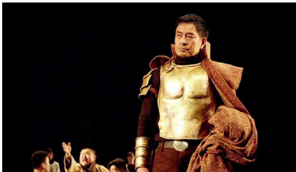
Actor Pu Cunxin as Coriolanus from 'Chinese Coriolanus at Edinburgh Festival' Vimeo posted by KT Wong Foundation. Available from http://vimeo.com/73625869 [accessed 17/03/2014] Embedded still