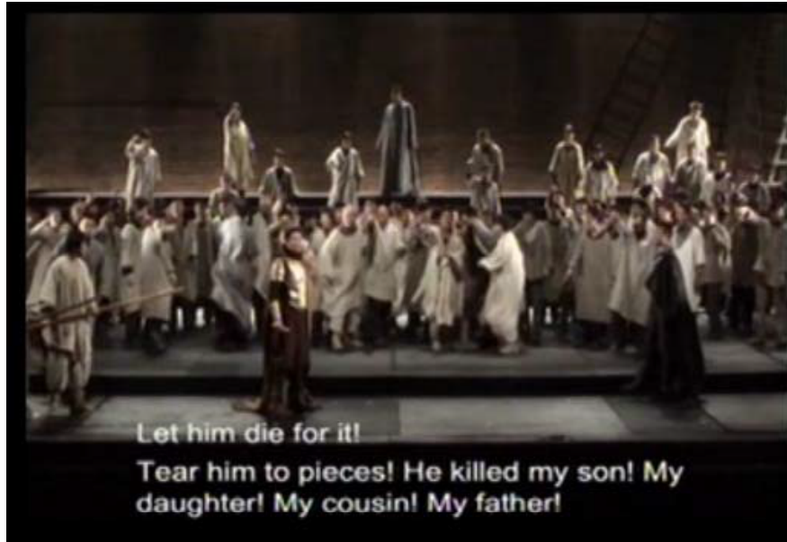
Migrant workers as the citizens confront Pu Cunxin as Coriolanus from the 2007 production at the Beijing People's Art Theatre 'Coriolanus'