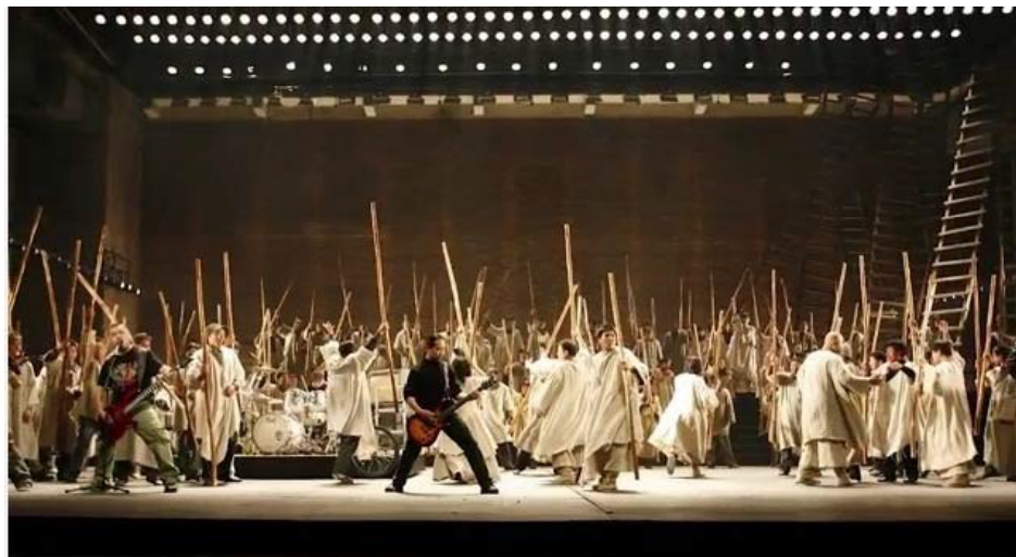
Cast and musicians, 'Coriolanus' from '2013 The Tragedy of Coriolanus' YouTube posted by EdintFest. Available from http://www.youtube.com/watch?v=MjKaUmLvQII