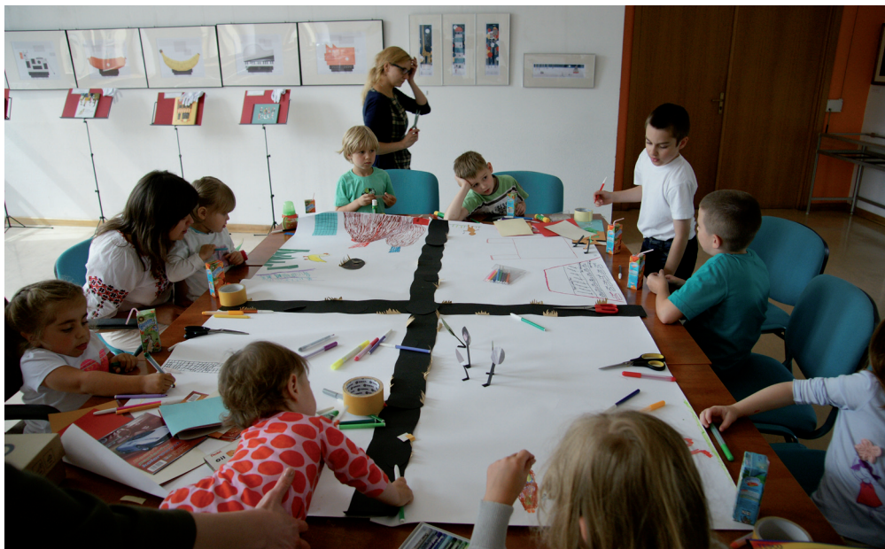
Art in university galleries. Fine art workshops at INTER Gallery — University of Lodz, Poland, Faculty of International and Political Studies