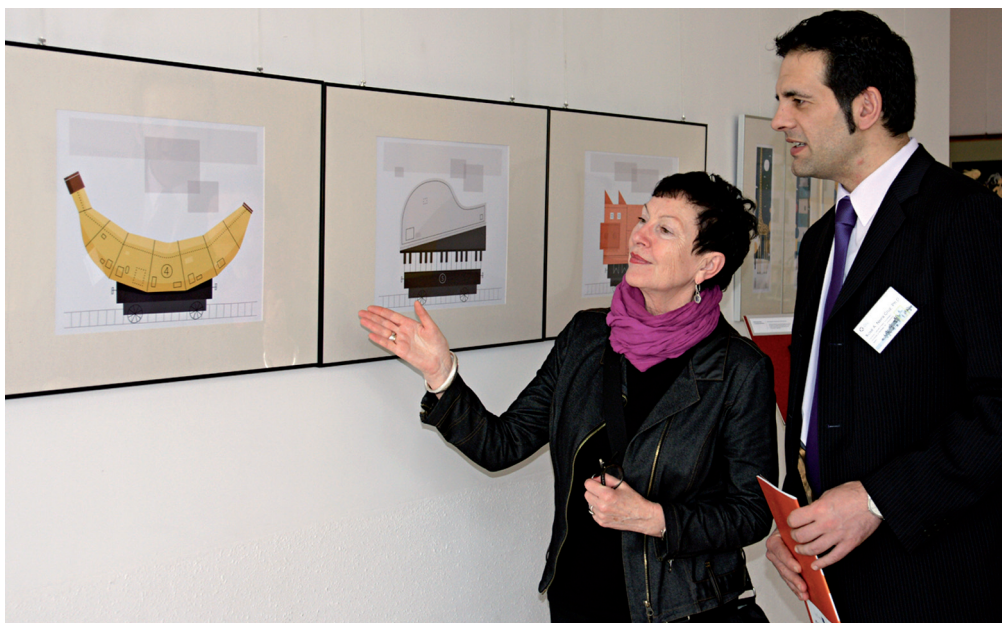
Art in university INTER Gallery — University of Lodz, Poland, Faculty of International and Political Studies. Exhibition "European fairy tale illustrated"