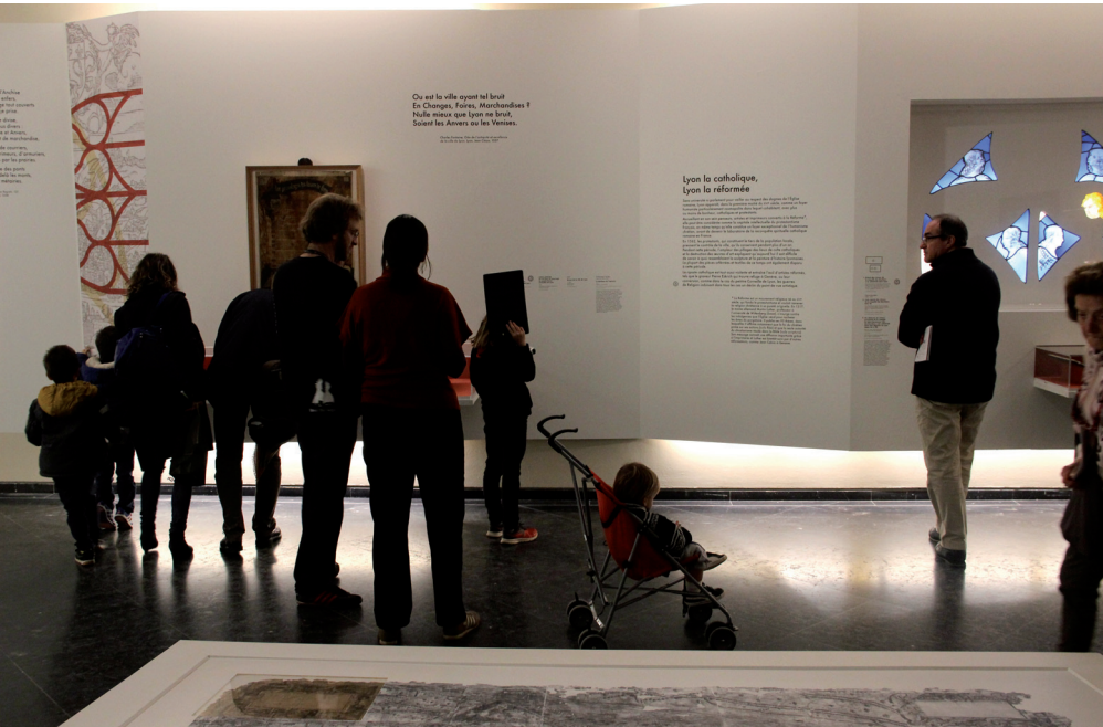
Wide audience... Museum of Contemporary Art Lyon, France