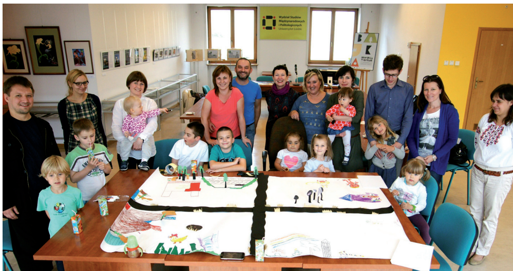
Art in university galleries. Fine art workshops at INTER Gallery — University of Lodz, Poland, Faculty of International and Political Studies