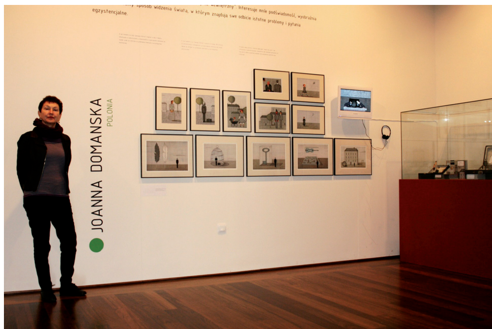
Art in university galleries. Ilustra Mundos exhibition — University of Santiago de Compostela