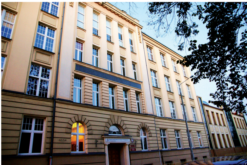
Art in university galleries — University of Lodz, Poland, Faculty of International and Political Studies