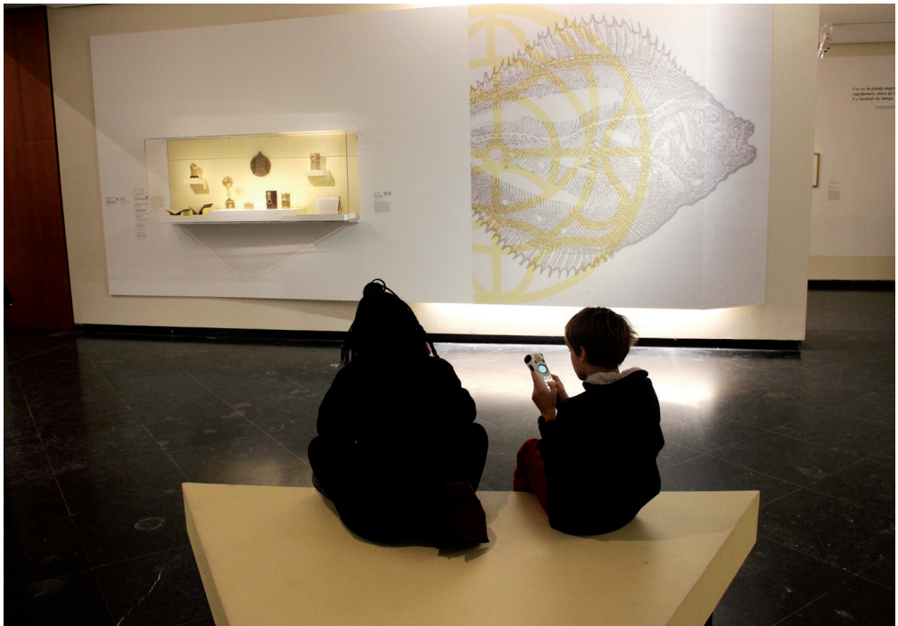
Wide audience of cultural institutions or how should we expand the attendance at cultural events. Museum of Contemporary Art Lyon, France