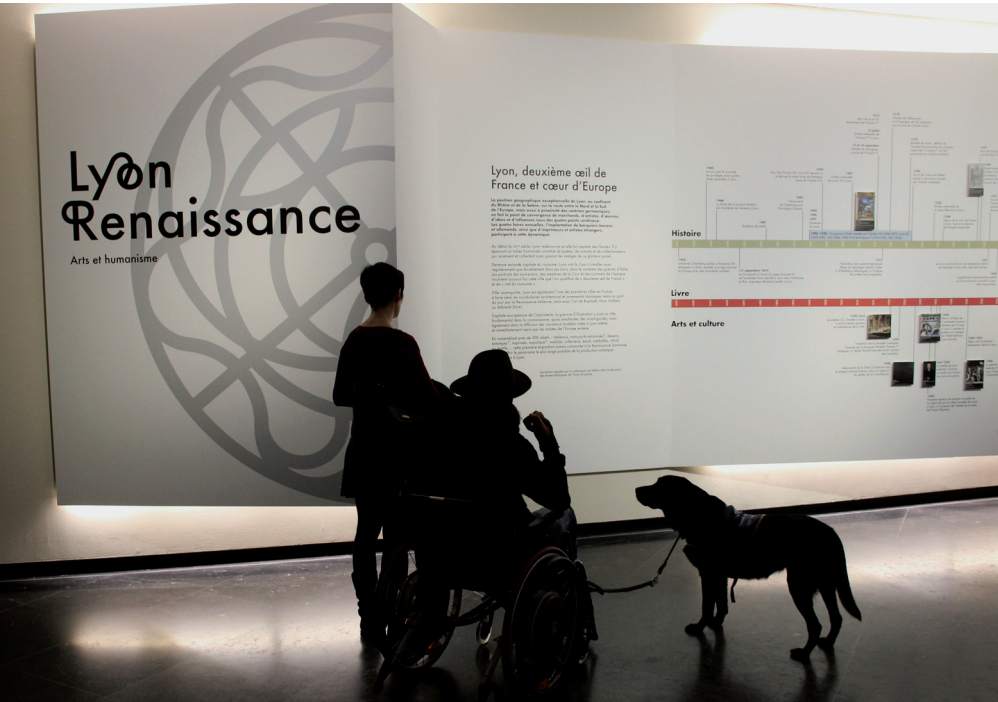
Wide audience... Museum of Contemporary Art Lyon, France