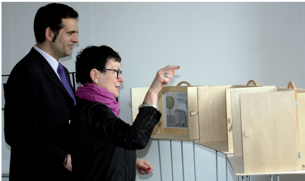
Art in university INTER Gallery — University of Lodz, Poland, Faculty of International and Political Studies. Exhibition "European fairy tale illustrated"