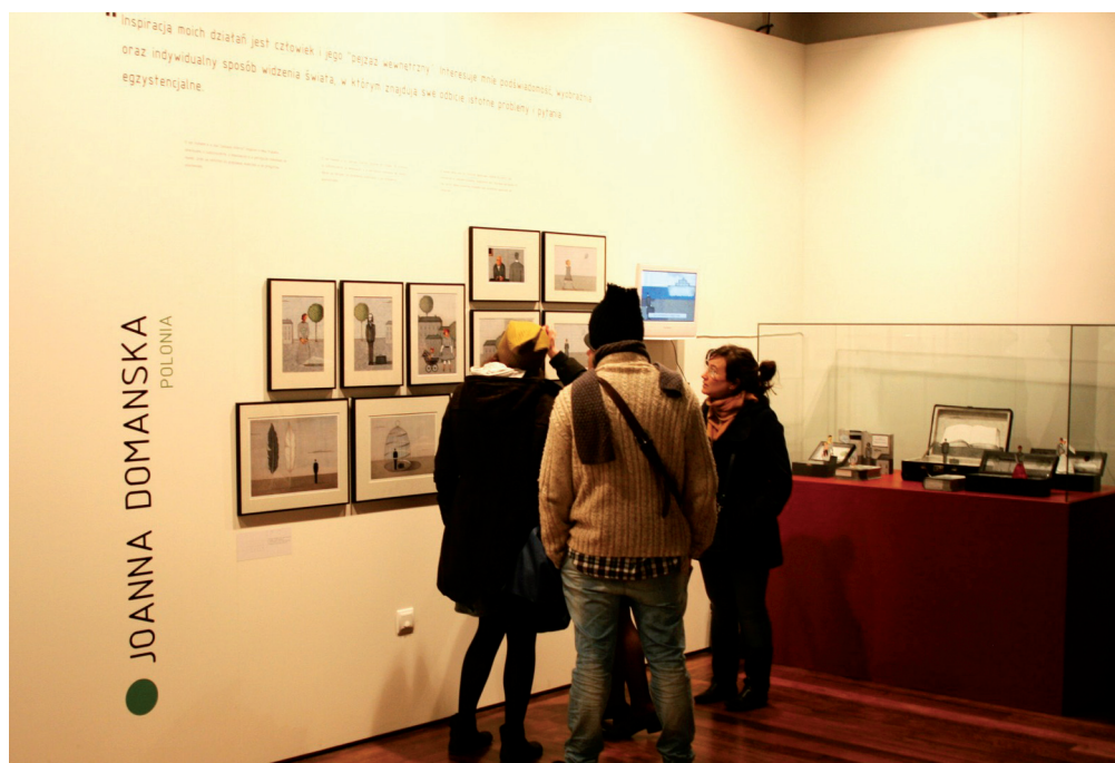
Art in university galleries. Ilustra Mundos exhibition — University of Santiago de Compostela