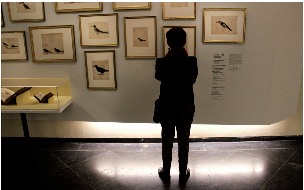
Wide audience of cultural institutions or how should we expand the attendance at cultural events. Museum of Contemporary Art Lyon, France