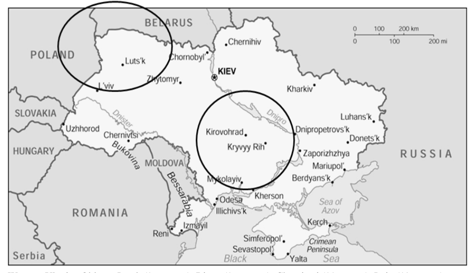
Western Ukraine Oblasts: Lutsk (16 rayons), Rivne (16 rayons), Chernivtsi (11 rayons), Lviv (19 rayons) Southern Ukraine Oblasts: Herson (17 rayons), Odessa (26 rayons)