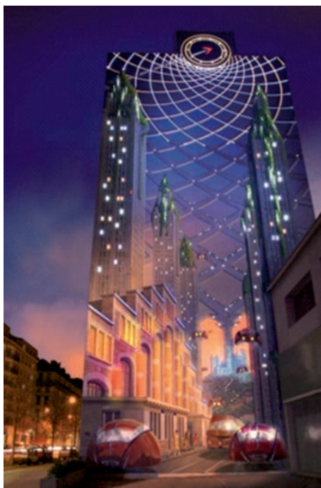
Photo 43. Erro, Hommage à la Bande-Dessinée , Angoulême (France)