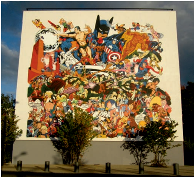
Photo 42. Yslaïre, Mémoires du XXè siècle , Angoulême (France)