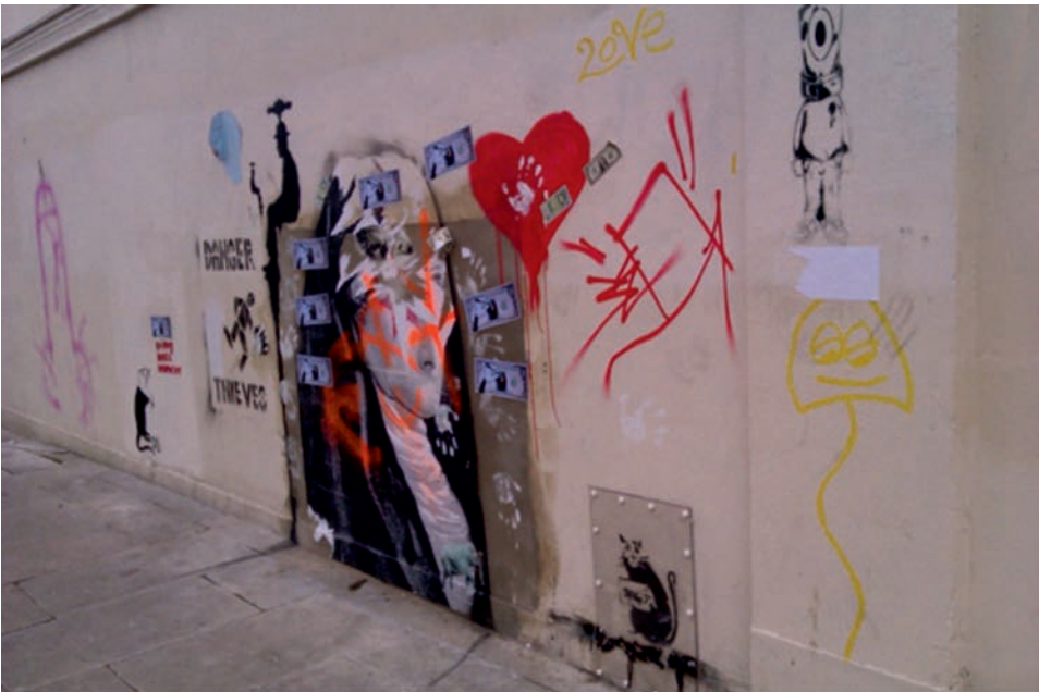
Photo 23. A wall on the side of a discount store in Turnpike Lane, North London, February 2013, photo by C. Turner