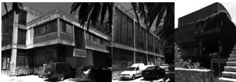
Photo 14. Unfinished urban space – Community Cultural Centre in Budva (1966)