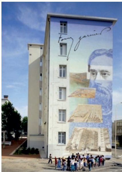
Photo 37. Cité Création, La Fresque des Lyonnais , Lyon (France)