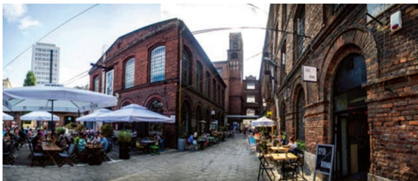
Photo 33. OFF Piotrkowska Centre, 142 Piotrkowska Street, Łódź, July 2014, photo by W. Szymański