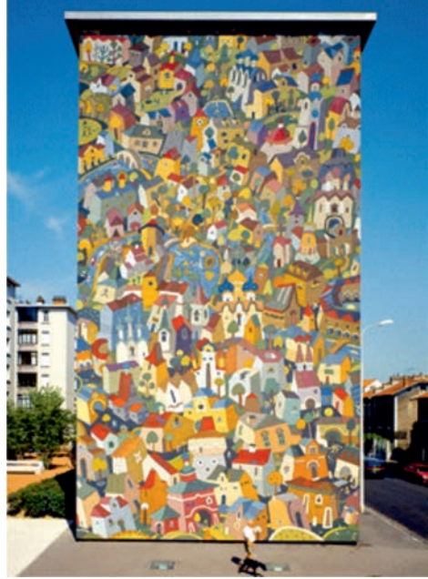
Photo 40. Youssouf Bath, L'Africaine , Lyon (France)