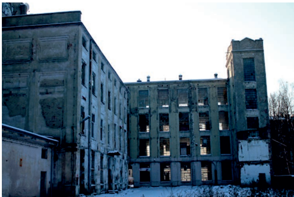
Photo 20. The destroyed “Setalana” silk article factory (1920), 65 Pomorska Street, Lodz, 2014, photo by M. Czechowicz