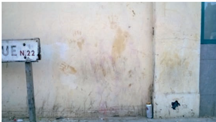
Photo 30. A wall on the side of a discount store in Turnpike Lane, North London, September, 2014