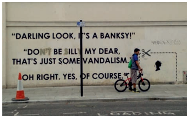
Photo 28–29. [as above], June, September, 2014