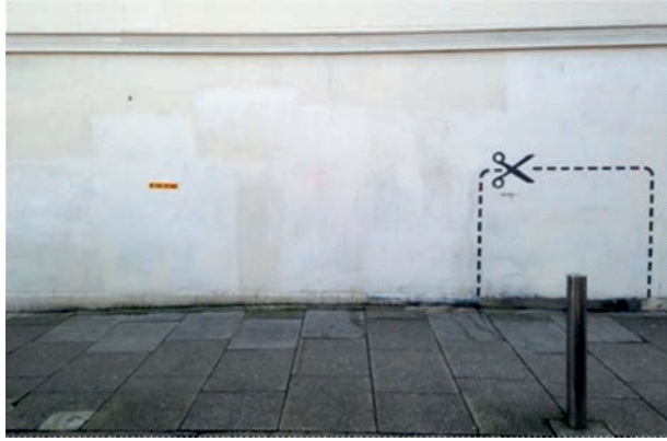
Photo 27. A wall on the side of a discount store in Turnpike Lane, North London, May, 2013