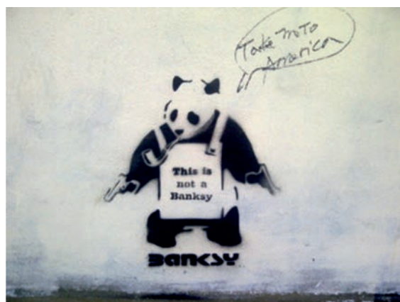
Photo 24–25. A wall on the side of a discount store in Turnpike Lane, North London, April 2013