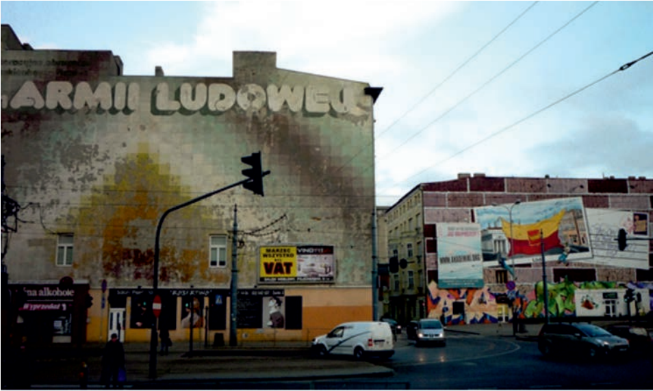
Photo 22. The walls full of urban signs and paintings depicting the palimpsest structure of the city, intersection of Zwirki and Kosciuszki Street, Łódź, 2015