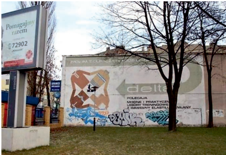
Photo 19. The large format wall advertising, the late 1950s – the mid 1960s, 61/63 Pomorska Street; the DELTA Knitting Industry Plant, Łódź