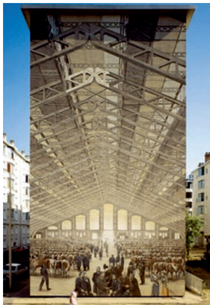
Photo 38. Cité Création, Visage de Tony Garnier , Lyon (France)