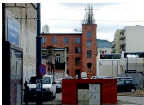
Photo 31–32. The “M. Tykociner i s-ka” factory (1920), 77 Pomorska Street, Łódź, June 2014, March 2016