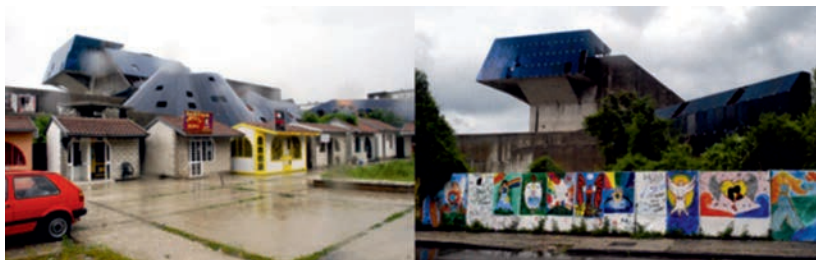
Photo 16. Resemiotisation of space is a product of “reideologisation” – “kiosk businesses”, Niksic