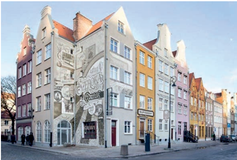
Photo 48. The revitalised façades of the modern townhouses in Szeroka Street in Gdansk, 2014