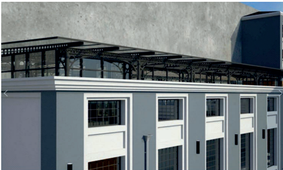
Photo 21. The renovation project of the “Setalana” (detail: the “lace” cast iron finial of the outbuilding), 65 Pomorska Street, Lodz, arch. J. Walczak