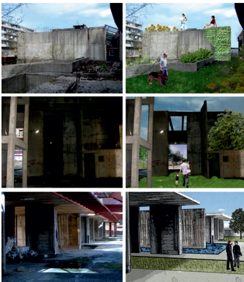
Photo 17 a–e. Recycling Unfinished – students’ work for the 4 th Congress of Students of Architecture – “Urban Recycling”, Belgrade, 2006, photo by the Faculty of Architecture, Podgorica