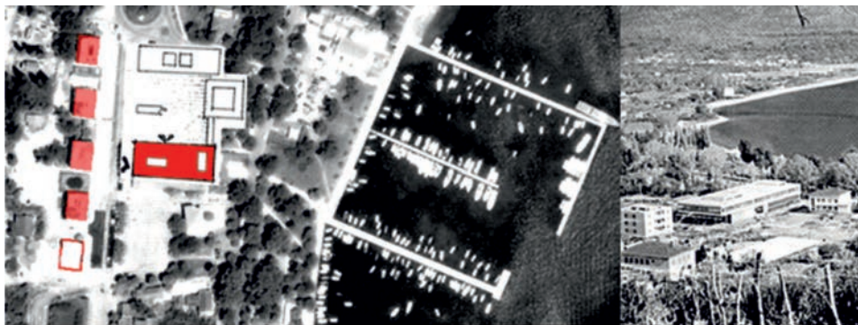
Photo 13. Unfinished urban space – Community Cultural Centre in Budva (1966)