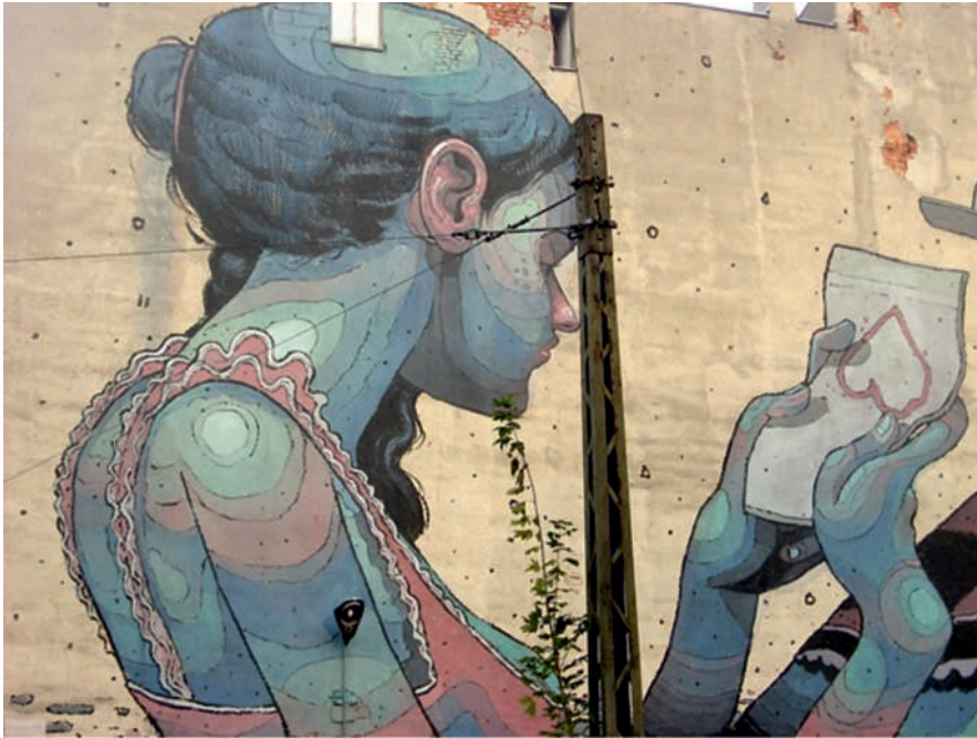
Photo 18. Aryz, Love Letter , 2012, detail