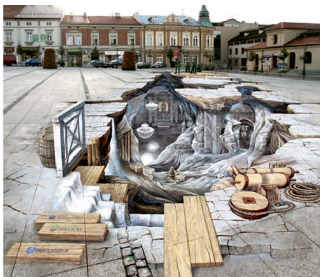
Photo 45. Ryszard Paprocki, Solny świat [Salt World], Wieliczka (Poland) 2012