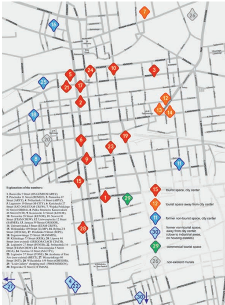
Photo 34. Locations of the Urban Forms Gallery murals in terms of different types of tourist space, September 2014, photo by J. Mokras-Grabowska