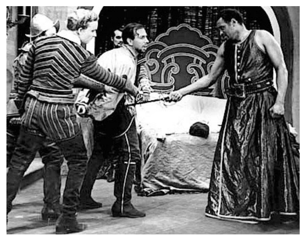
Figure 2. Robeson as Othello and Jose Ferrera as Iago in 1942 Broadway production.