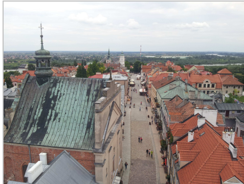
Photo 6. Opatowska St – view from The observation deck at Opatowska Gate