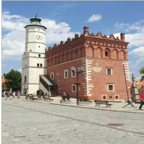
Photo 3. Town hall in Sandomierz