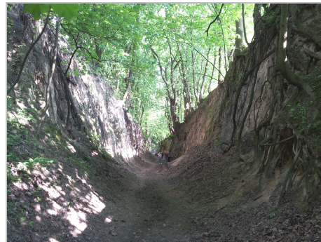
Photo 8. Loess ravine of St Jadwiga