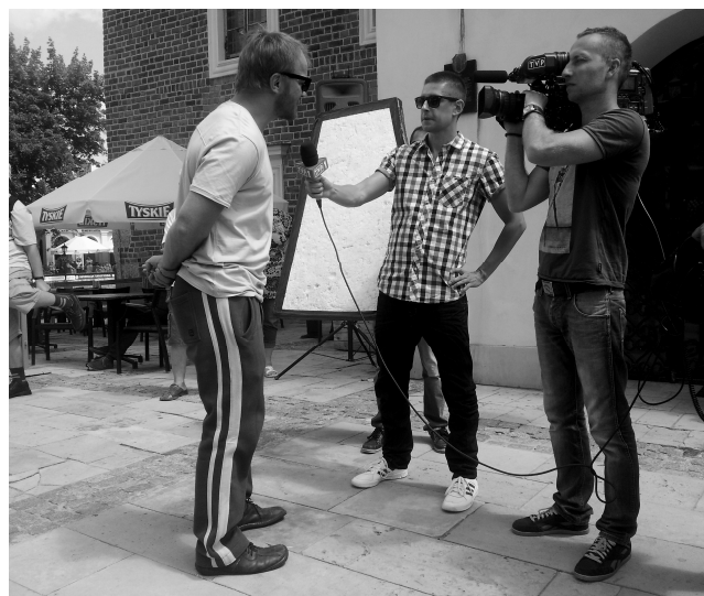
Photo 10. The cast of ' Ojciec Mateusz ' during the promotion ' Ojciec Mateusz - tajemnicze zagadki Sandomierza ' on 2 July 2014 at the town hall in Sandomierz

As a consequence, the serial has played a key role in promoting the town and creating its image as a pleasant and hospitable place (Photo 10).