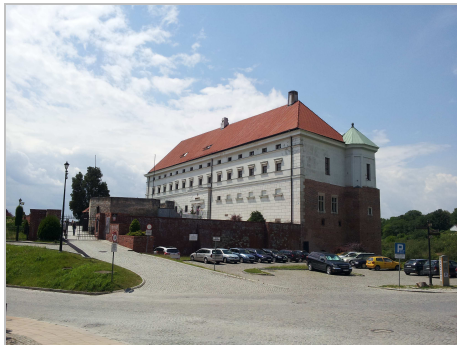
Photo 7. The castle in Sandomierz