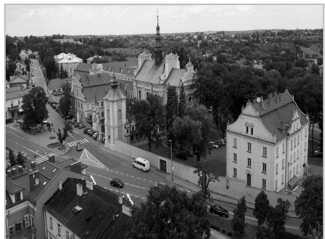
Photo 2. Benedictine convent complex with St. Michael's Church: the view from Opatowska Gate

The entire area of the historic urban and architectural complex of Sandomierz (Fig. 2) covers about 40 hectares, of which 16 hectares belong to today's Stare Miasto (the area that received the charter). All the monuments, among which sacred sites dominate, are located there. These include the cathedral complex