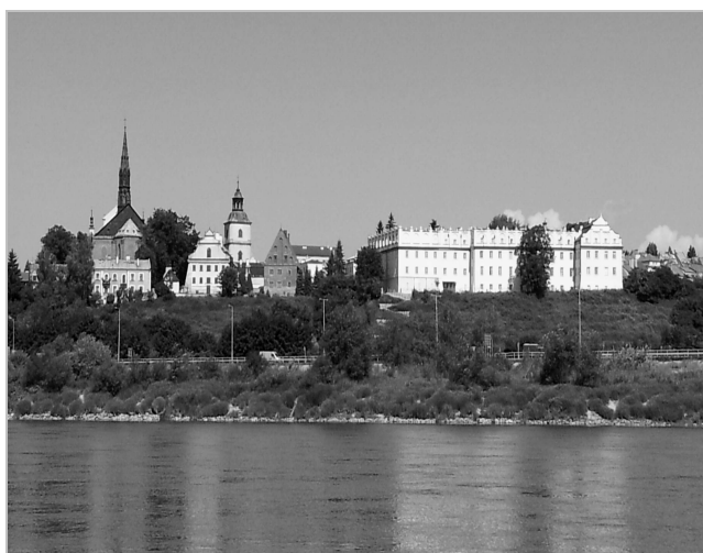
Photo 1. Sandomierz. Panorama of the town from the Vistula

One of the best preserved Polish Old Towns is located in Sandomierz (25,000 inhabitants in 2015). It is situated on high ground, a hill mostly covered with loess in the form of an elongated promontory, separated to this day from the rest of the town by deep ravines and the valley of Vistula. This gives the town a particularly high landscape value. Its form is most clearly visible from the Vistula side, and consists of successive dominant features, enriching the horizontal composition of the entire urban complex (Photo 1).