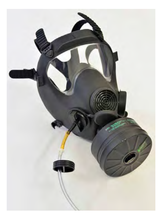
Figure 2. MP-5 gas mask used by the Polish army