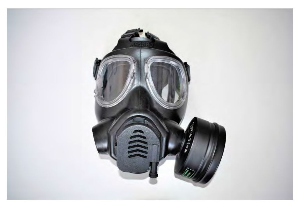
Figure 3. MP-6 gas mask used by the Polish army