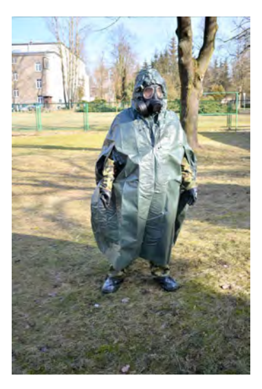
Figure 10. Protective cover

The third kind of protective respiratory gear is considered 'escape equipment', as it is intended not for prolonged working use, but simply for emergency use in the fast evacuation of hazardous areas. A good example of escape equipment is the protective hood and cover shown in figures 10 and 11, below.