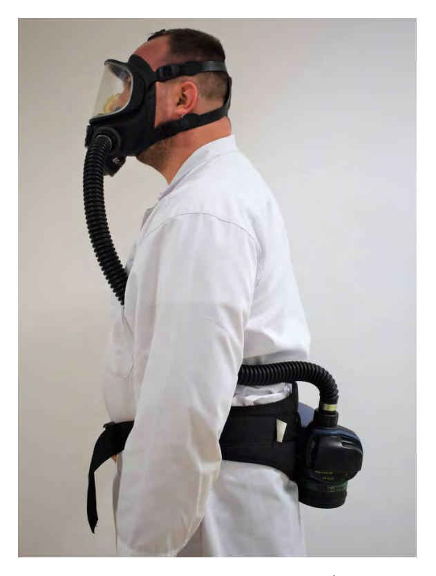
Figure 16. Mask with an extra airflow system

– Mask tightness – it is very important to ensure a close fit to the wearer's face. Masks and half-masks are available in different sizes, so it is important that wearer's carefully check the tightness of their particular mask before entering the hazardous environment. For men with particularly thick facial hair, there are, for example, masks with extra airflow systems that produce some hypertension in the face (Fig. 16 and 17).