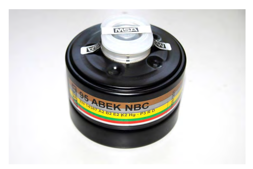
Figure 8. A2B2E2K2HgP3 combined filter – Type ABEKHg, Class 2 filter (P2) Class 3 (P3)