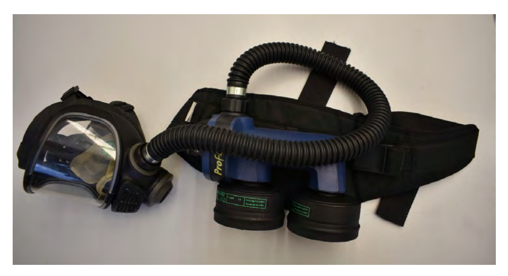
Figure 17. Mask with an extra airflow system