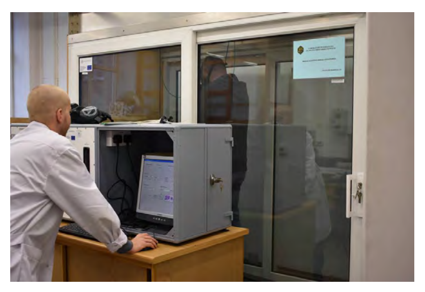
Figure 20. Checking total internal leakage