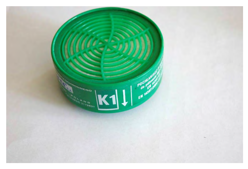
Figure 5. K1 Absorber – Type K, Class 1