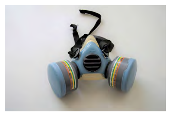
Figure 1. Half-mask with combined ABEKP filters

Filters, absorbers and combined filters are used in various types of masks and respirators, which come in two varieties: half-masks (Fig. 1) and full-face masks (Fig. 2 and 3).