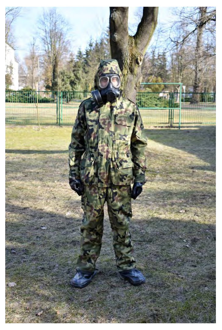
Figure 14. FOO-1 Filter Cloth

enhancing user comfort. Due to its low protection value against liquids, the shoes and gloves of protective filter clothing are made of isolating materials. Unlike isolation suits, filter clothing cannot be decontaminated after use.