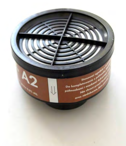
Figure 7. A2 Absorber – Type A, Class 2