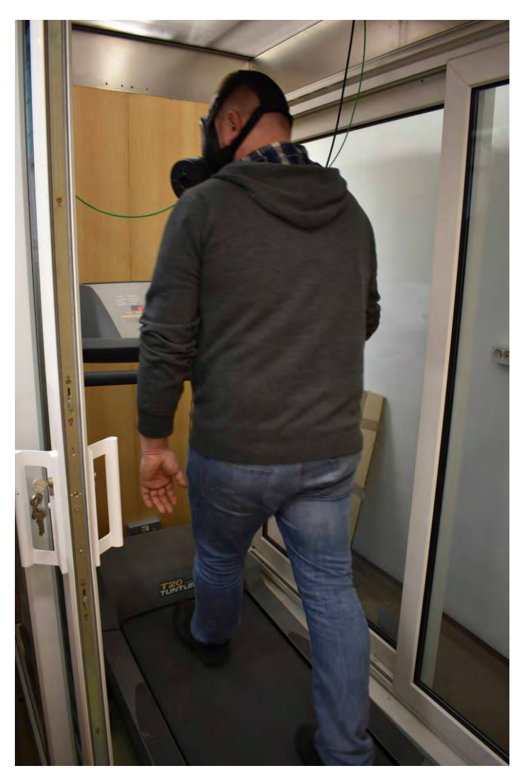
Figure 19. Checking total internal leakage

Using a PORTACOUNT device, you can quickly determine if a mask fits the wearer's face properly by checking total internal leakage from the mask. The mask's user is located on a treadmill in a sealed chamber (Fig. 19 and 20). The interior of the chamber is filled with a sodium chloride aerosol. The user then performs a series of exercises to simulate the use of the mask in real-life conditions (fast walking, turning their head up and down and side-to-side etc.). Using a spectrophotometer, the concentration of sodium chloride in the chamber and under the mask is determined and the internal leakage is thus calculated.