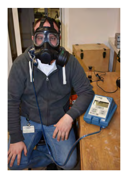
Figure 18. Checking the fit of a mask, using a PORTACOUNT

– The PORTACOUNT unit simultaneously counts the number of particles in the air around the mask, and under the mask. It calculates the ratio of surrounding particles to the number of particles under the mask, giving the FIT FACTOR, a properly fitting mask will have a FIT FACTOR of at least 10,000.