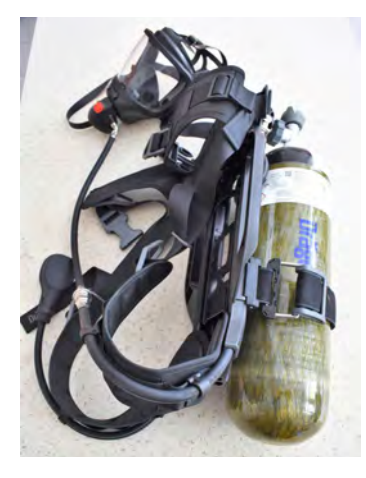
Figure 9. Isolation breathing apparatus

- Autonomous (with a tank or recycling system).