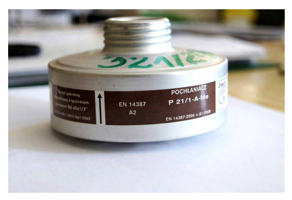
Figure 6. A2 Absorber – Type A, Class 2