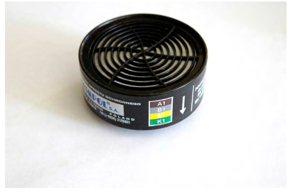
Figure 4. A1B1E1K1 Absorber – Type ABEK, Class 1

Figures 4–8 show the markings used by absorber and filter manufacturers: