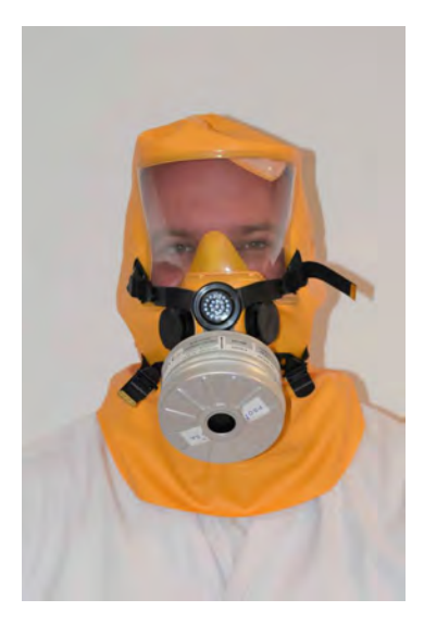
Figure 11. KO-1 protective hood