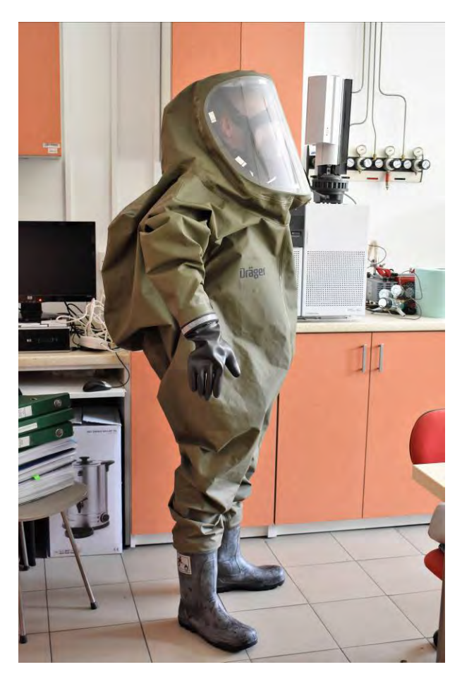
Figure 13. Examples of gas-tight suit type 1

Gas-tight suits are also used by specialised chemical rescue workers, and can take the form of one-piece suits with a gas-tight lock. They provide the highest level of protection and are designed for use in particularly hazardous conditions, such as with CWAs, Toxic Industrial Chemicals (TICs), and low oxygen levels. They are designed for use with breathing apparatus, and most importantly, can be decontaminated after use.