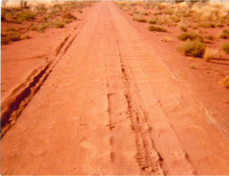
Fig. 3. View from my Toyota 4WD troop carrier on the rough bush track, close to Lajamanu, c. 1982.