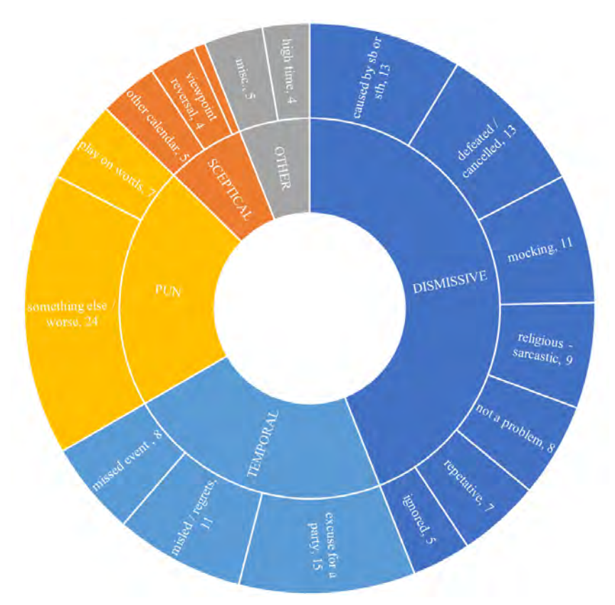
Figure 2. 2012 memes

The end of the Mayan calendar on December 21, 2012 was believed to signal a cataclysmic end of the world. This opened the door to a number of speculations, discussed in both scientific and popular culture sections of Polish newspapers. The internet memes addressing these doomsday predictions are much more numerous and much more varied than those developed in response to Camping's predictions. The graph in Figure 2 presents the diversity of these responses.