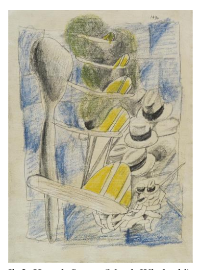
II. 2. Henryk Streng (Marek Włodarski), Rysunek z kapeluszami , 1930, ołówek, kredka, gwasz, papier, 26,5 x 19,5 cm, Muzeum Sztuki w Łodzi.