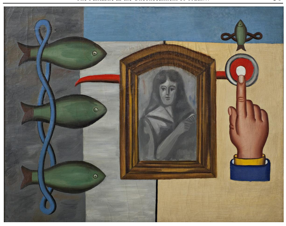
II. 1. Henryk Streng (Marek Włodarski), Ryby i portret , 1930, olej, płótno, 65 x 82 cm, Muzeum Sztuki w Łodzi.