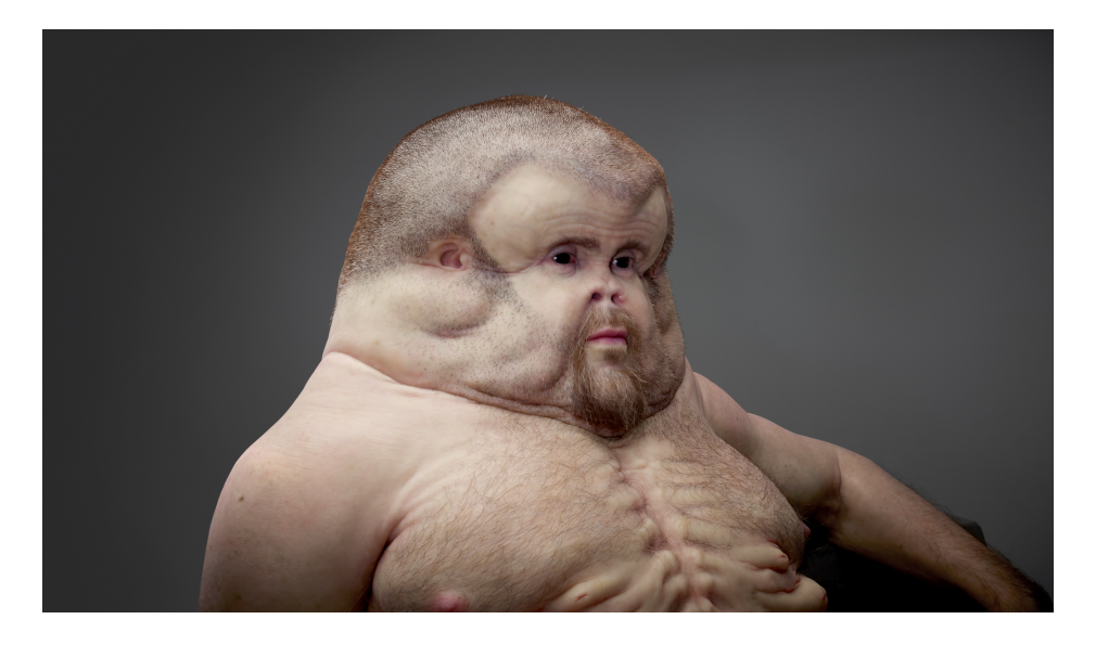
Fig. 1. Patricia Piccinini, Graham , 2016. Silicone, human hair, life-size sculpture. Australia, 2016.

Technology creates a completely different living environment than the one to which evolution has adapted us. A good example is a sedentary lifestyle. What we would look like if we were evolutionarily adapted to spend so much time in means of transport is shown by the result of cooperation between Australian artist Patricia Piccini and a trauma surgeon, a specialist in road accidents. "Graham" (2016) is a sculpture resembling an enhanced version of a human, better adapted to a sedentary lifestyle in means of transport. Evolutionarily, the process of adaptation to changes is on, but it is certainly very long and finally, none of us would like to look like Graham. His flat face and huge head surrounded by a layer of fat attached directly to the ribs without a neck do not fit into the aesthetically desirable physiognomy.