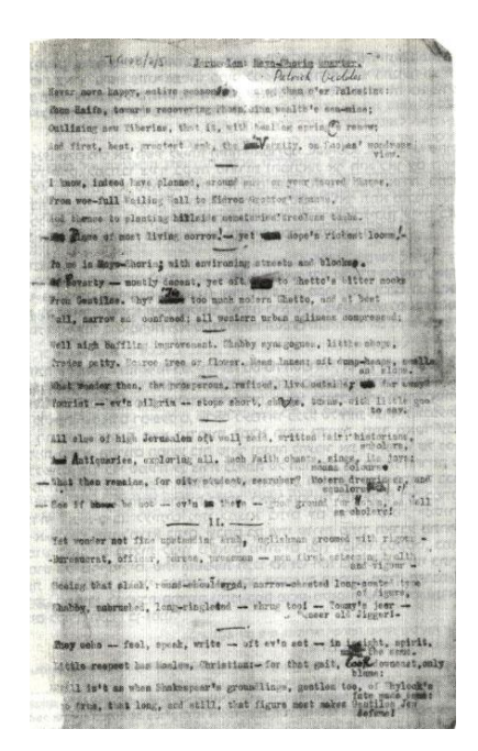
Fig. 2. The first page of the poem "Jerusalem – Meyo Shorim Quarter"