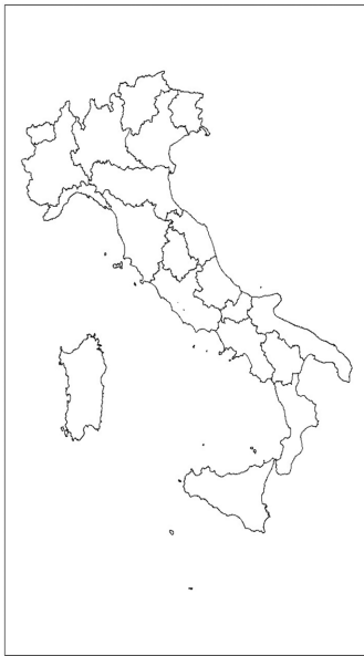
NUTS-2 regions (n = 20)