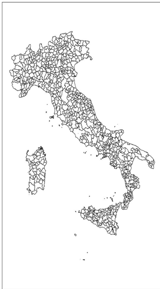
Local districts (n = 784)